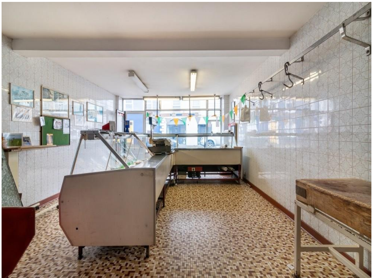
Butcher Shop, Residence & Abattoir, Main Street, Castlerea, F45 E398