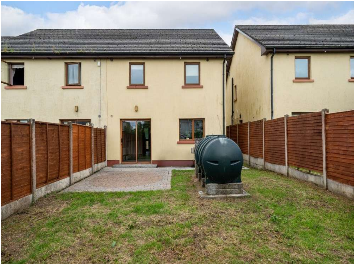
5 The Paddock, Athleague, Co. Roscommon. F42 TD42