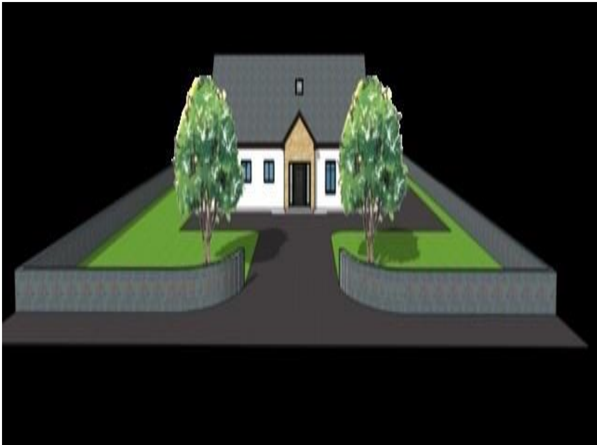
C. 0.55 Acre Site With Full Planning, Patch, Glenamaddy, County Galway