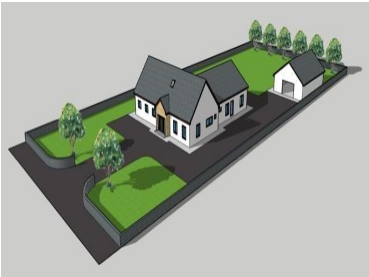
C. 0.55 Acre Site With Full Planning, Patch, Glenamaddy, County Galway