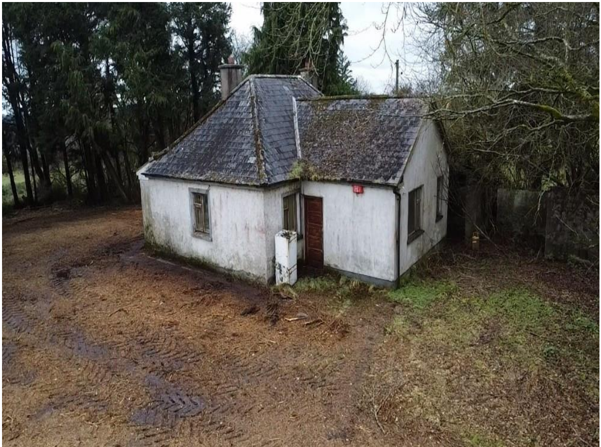
Residence On C. 24 Acres, Castleruby, Tulsk, F45 W957