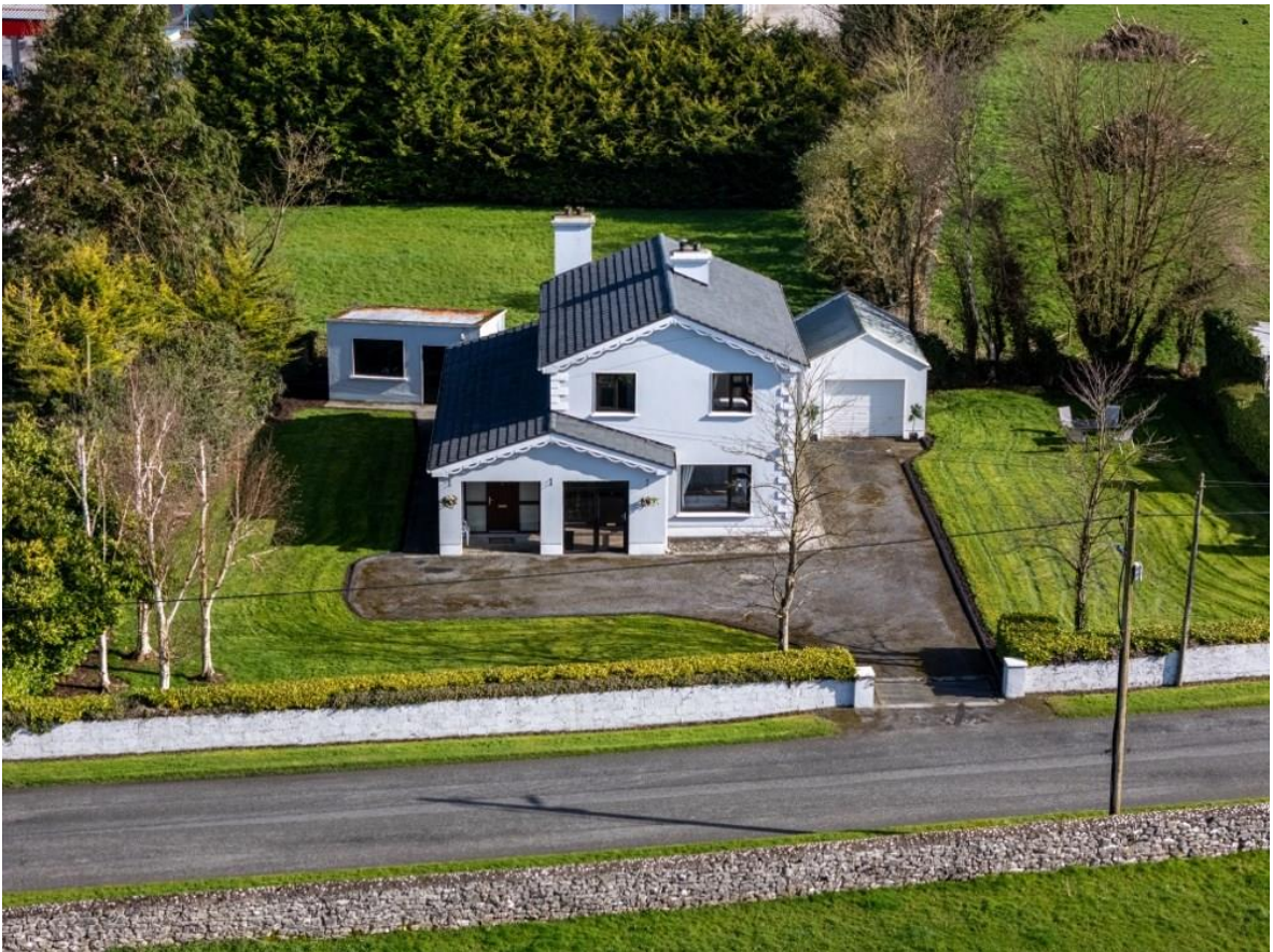
Athleague, Co. Roscommon. F42 TE84