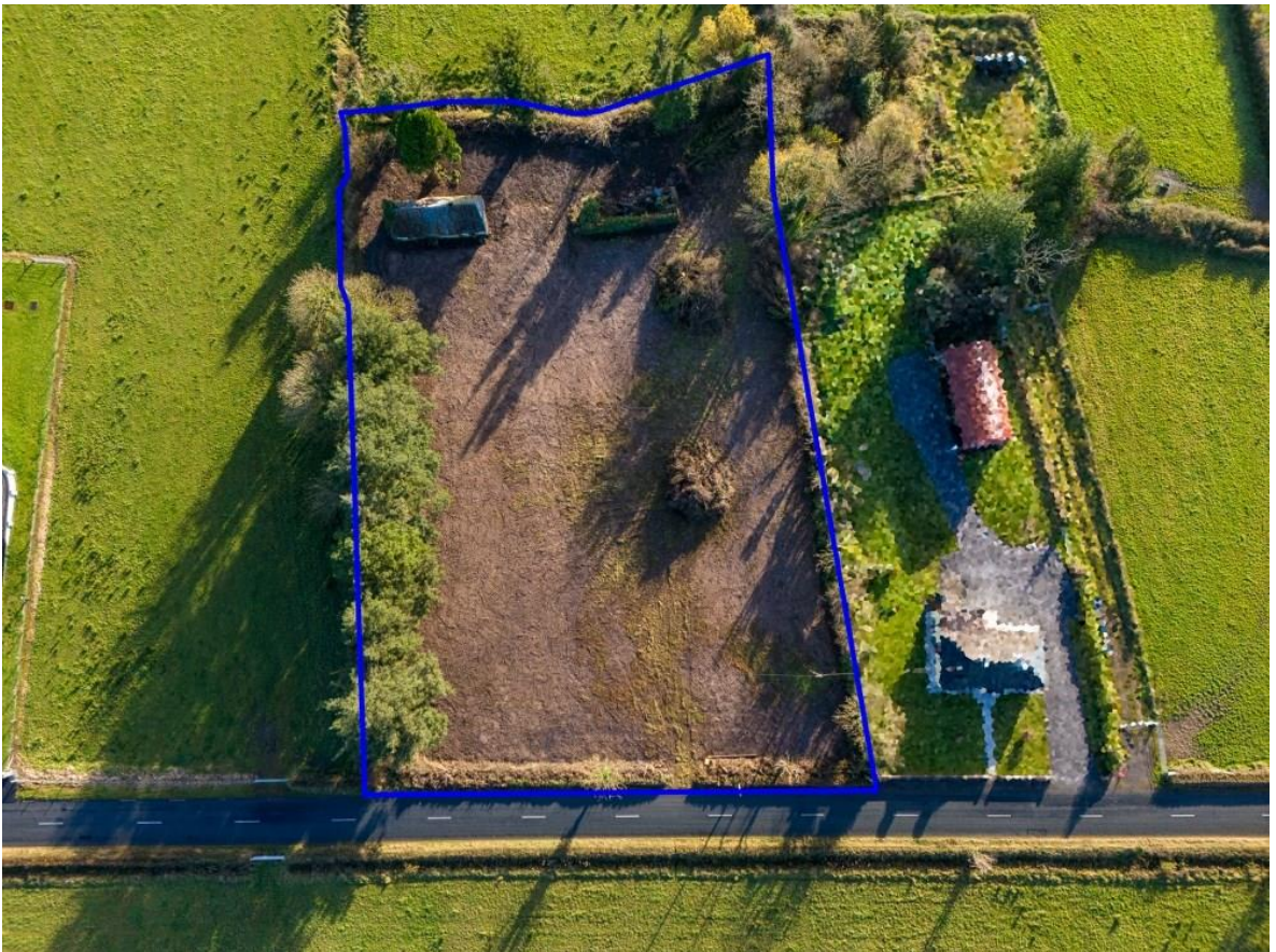
Cottage on c. 1.58 Acres at Coalpits, Creggs, Co. Galway.