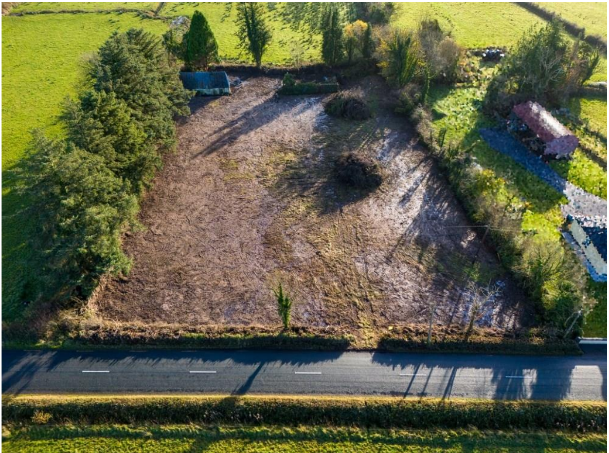
Cottage on c. 1.58 Acres at Coalpits, Creggs, Co. Galway.