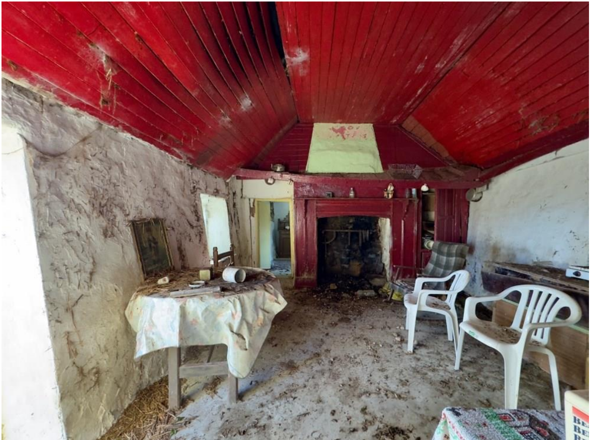
Cottage on c. 1.58 Acres at Coalpits, Creggs, Co. Galway.