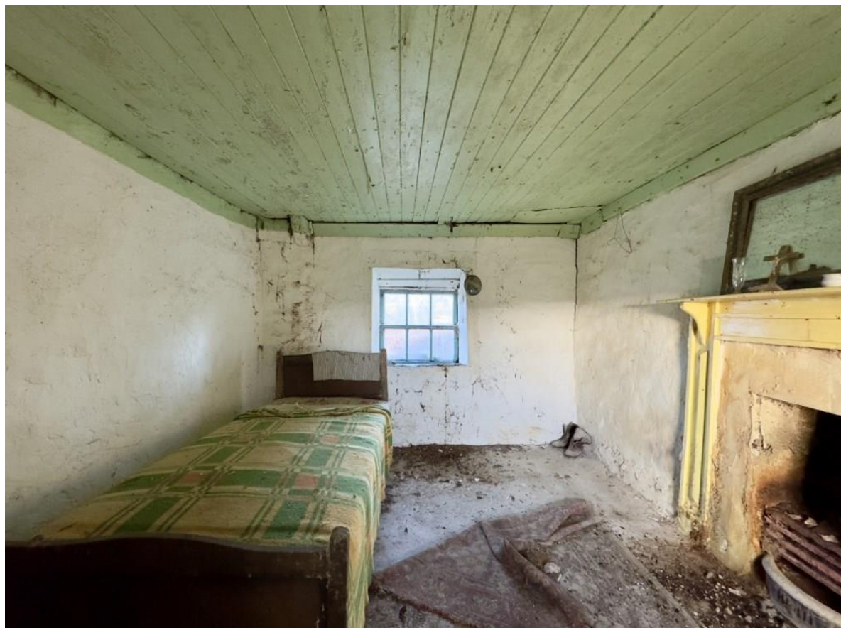
Cottage on c. 1.58 Acres at Coalpits, Creggs, Co. Galway.