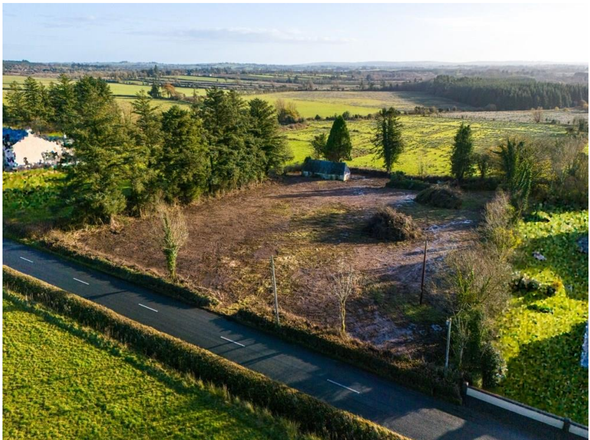
Cottage on c. 1.58 Acres at Coalpits, Creggs, Co. Galway.