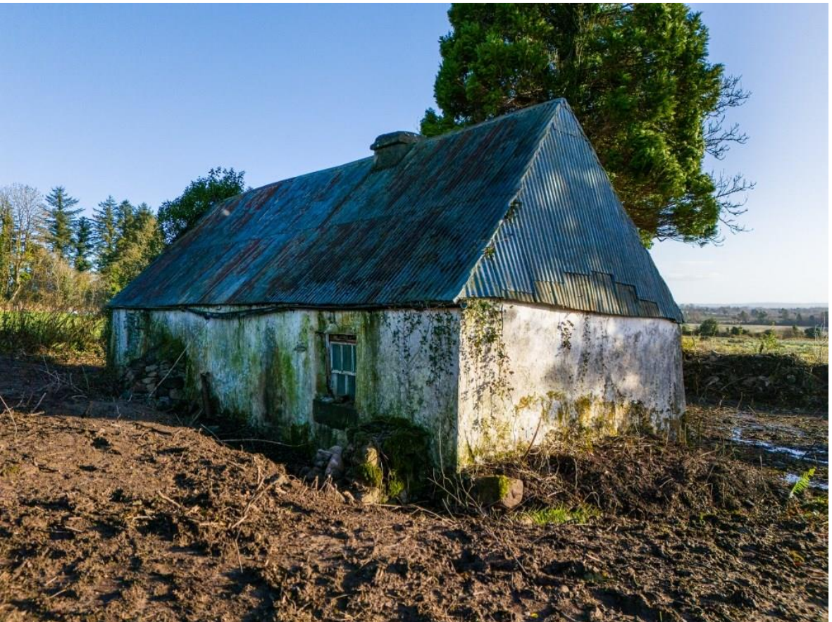
Cottage on c. 1.58 Acres at Coalpits, Creggs, Co. Galway.