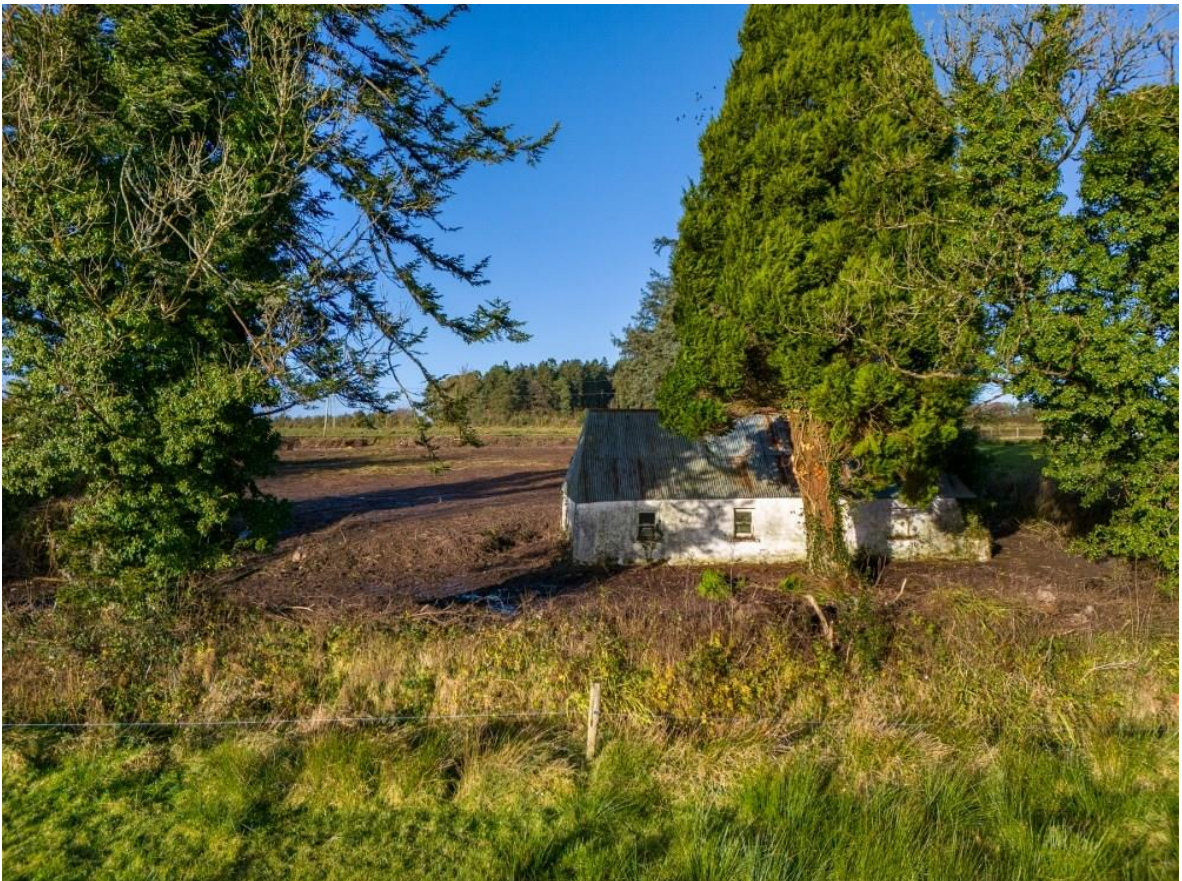
Cottage on c. 1.58 Acres at Coalpits, Creggs, Co. Galway.