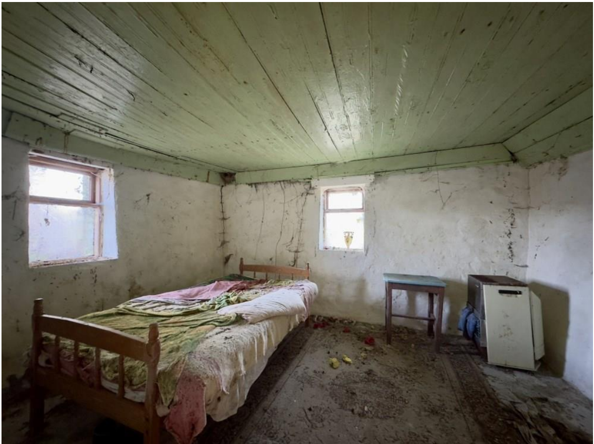
Cottage on c. 1.58 Acres at Coalpits, Creggs, Co. Galway.