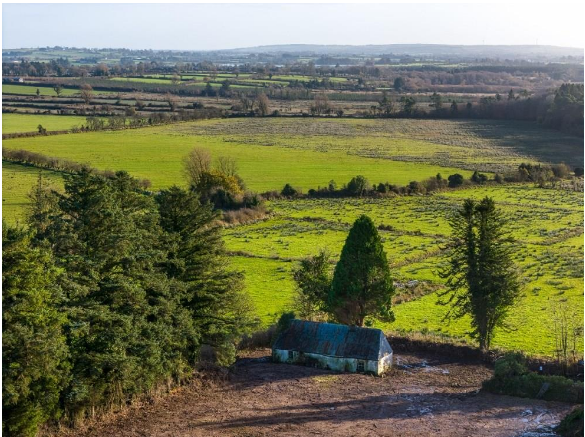
Cottage on c. 1.58 Acres at Coalpits, Creggs, Co. Galway.