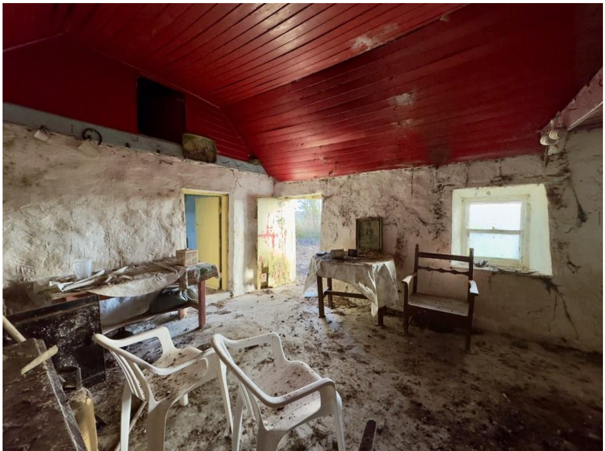
Cottage on c. 1.58 Acres at Coalpits, Creggs, Co. Galway.