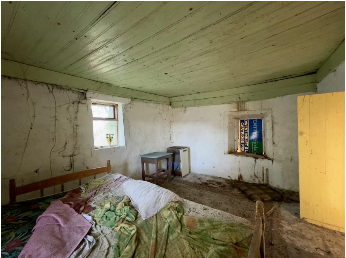
Cottage on c. 1.58 Acres at Coalpits, Creggs, Co. Galway.