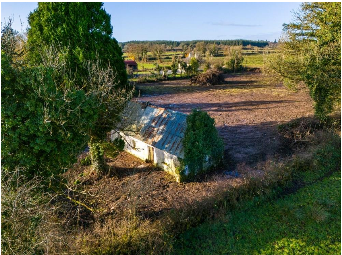
Cottage on c. 1.58 Acres at Coalpits, Creggs, Co. Galway.