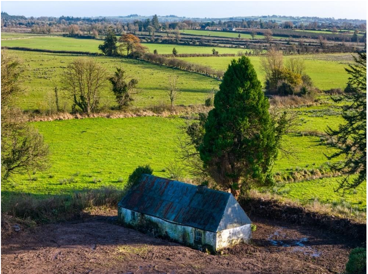
Cottage on c. 1.58 Acres at Coalpits, Creggs, Co. Galway.