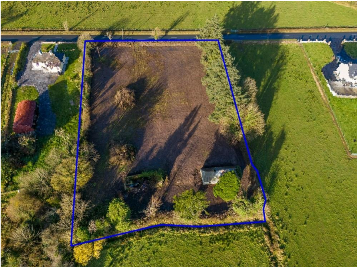
Cottage on c. 1.58 Acres at Coalpits, Creggs, Co. Galway.