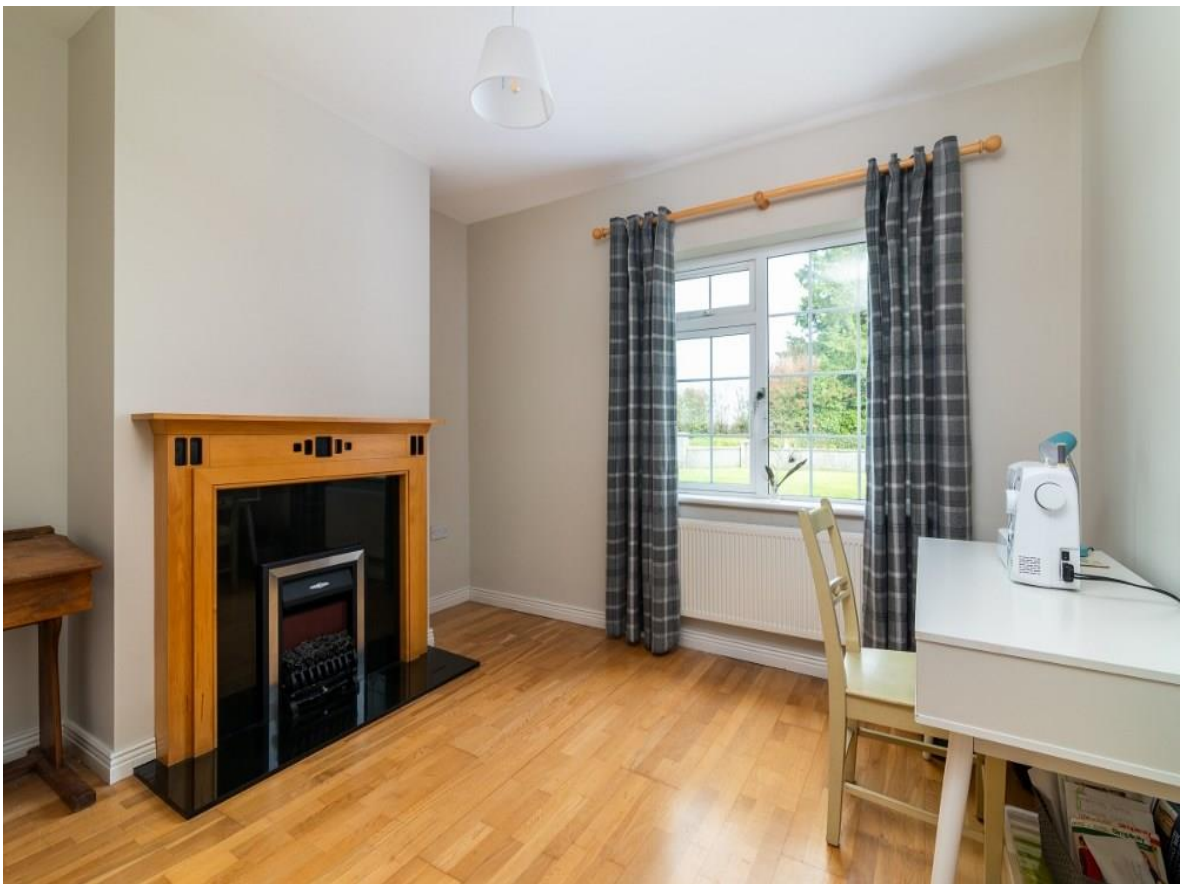
Residence on c. 8.05 Acres at The Demesne, Frenchpark, Co. Roscommon. F45 D292