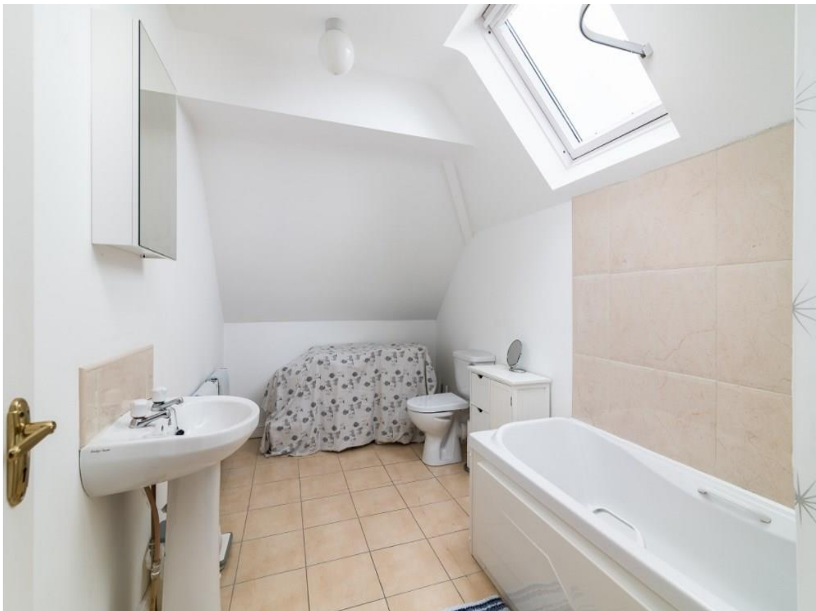
Residence on c. 8.05 Acres at The Demesne, Frenchpark, Co. Roscommon. F45 D292