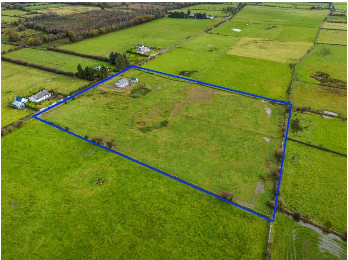
Residence on c. 8.05 Acres at The Demesne, Frenchpark, Co. Roscommon. F45 D292