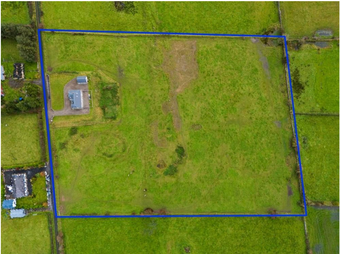
Residence on c. 8.05 Acres at The Demesne, Frenchpark, Co. Roscommon. F45 D292