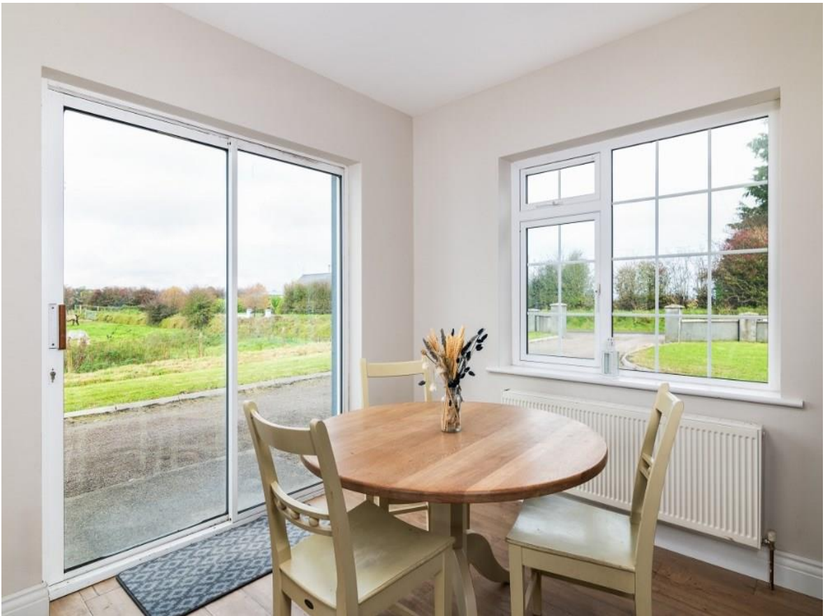
Residence on c. 8.05 Acres at The Demesne, Frenchpark, Co. Roscommon. F45 D292