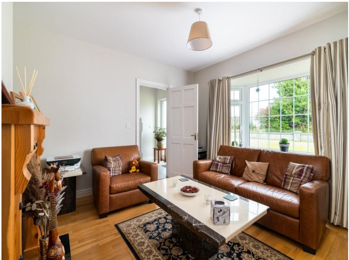
Residence on c. 8.05 Acres at The Demesne, Frenchpark, Co. Roscommon. F45 D292