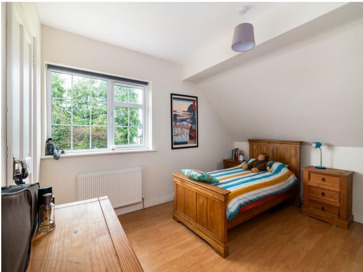
Residence on c. 8.05 Acres at The Demesne, Frenchpark, Co. Roscommon. F45 D292