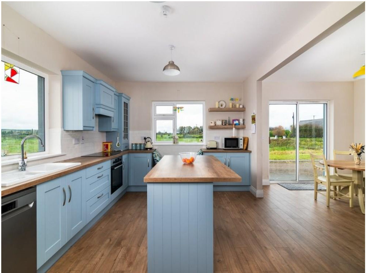
Residence on c. 8.05 Acres at The Demesne, Frenchpark, Co. Roscommon. F45 D292