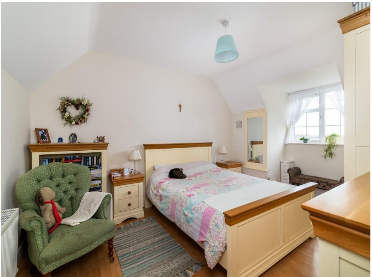
Residence on c. 8.05 Acres at The Demesne, Frenchpark, Co. Roscommon. F45 D292