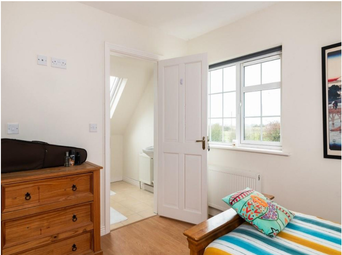
Residence on c. 8.05 Acres at The Demesne, Frenchpark, Co. Roscommon. F45 D292