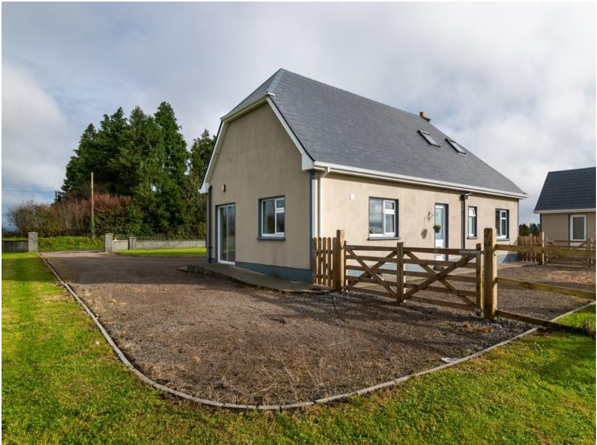
Residence on c. 8.05 Acres at The Demesne, Frenchpark, Co. Roscommon. F45 D292