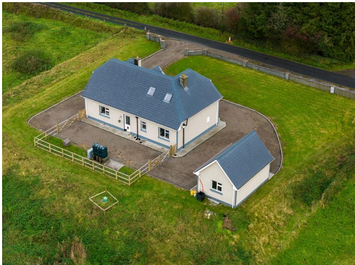
Residence on c. 8.05 Acres at The Demesne, Frenchpark, Co. Roscommon. F45 D292