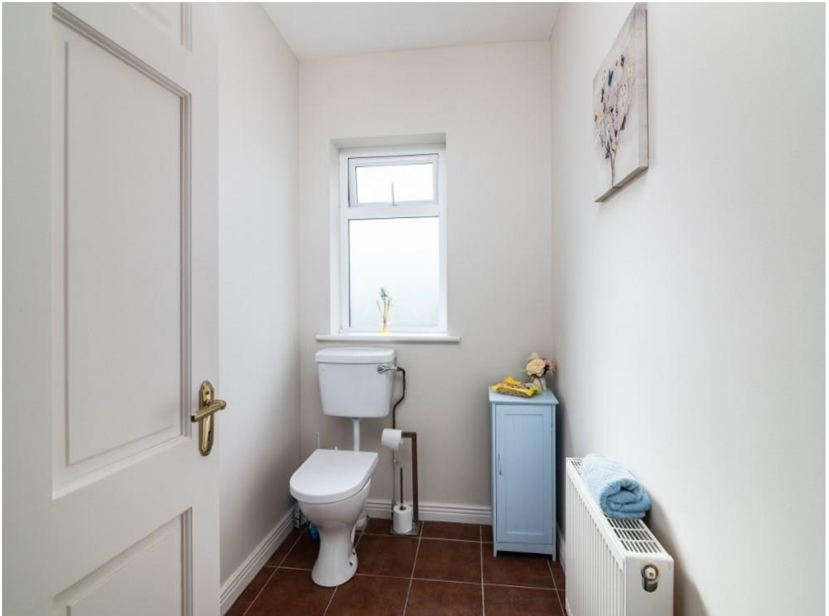
Residence on c. 8.05 Acres at The Demesne, Frenchpark, Co. Roscommon. F45 D292