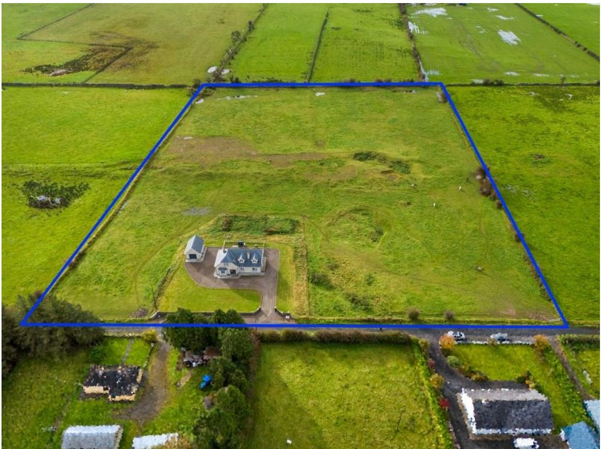
Residence on c. 8.05 Acres at The Demesne, Frenchpark, Co. Roscommon. F45 D292