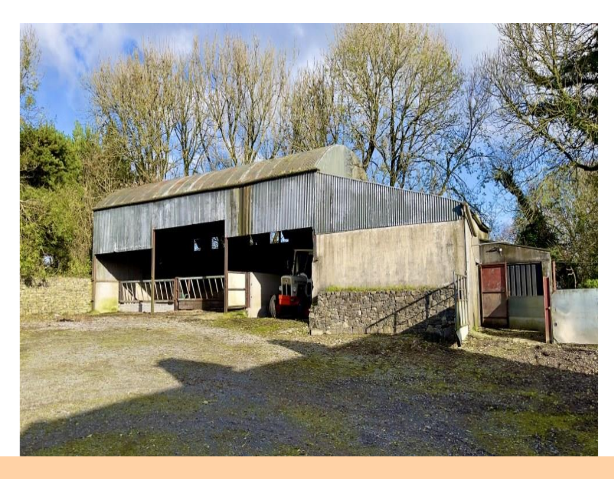
Residence & Outbuildings On C. 0.82 Acres, Lisheennaheltia, Williamstown, F45 ED25