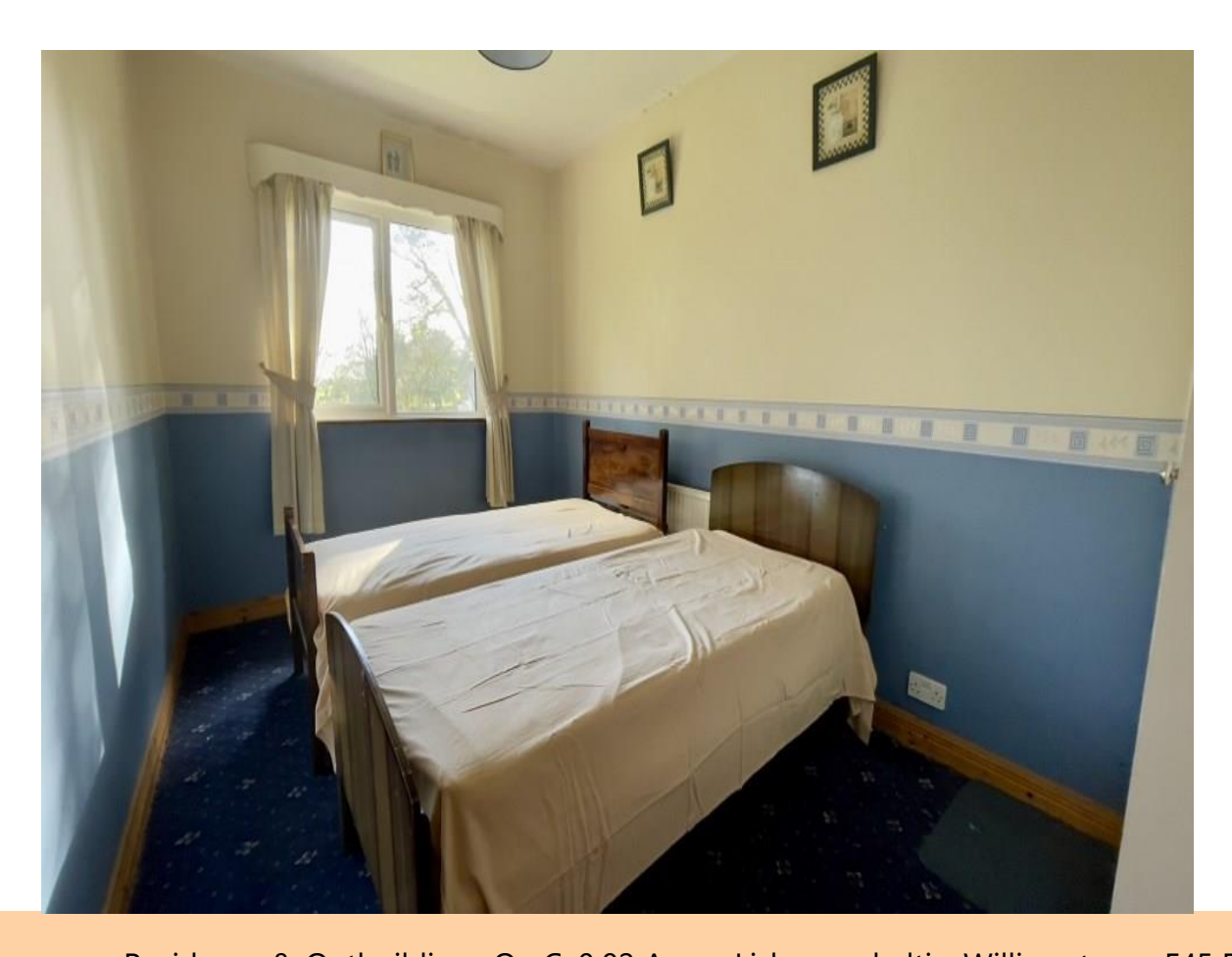
Residence & Outbuildings On C. 0.82 Acres, Lisheennaheltia, Williamstown, F45 ED25