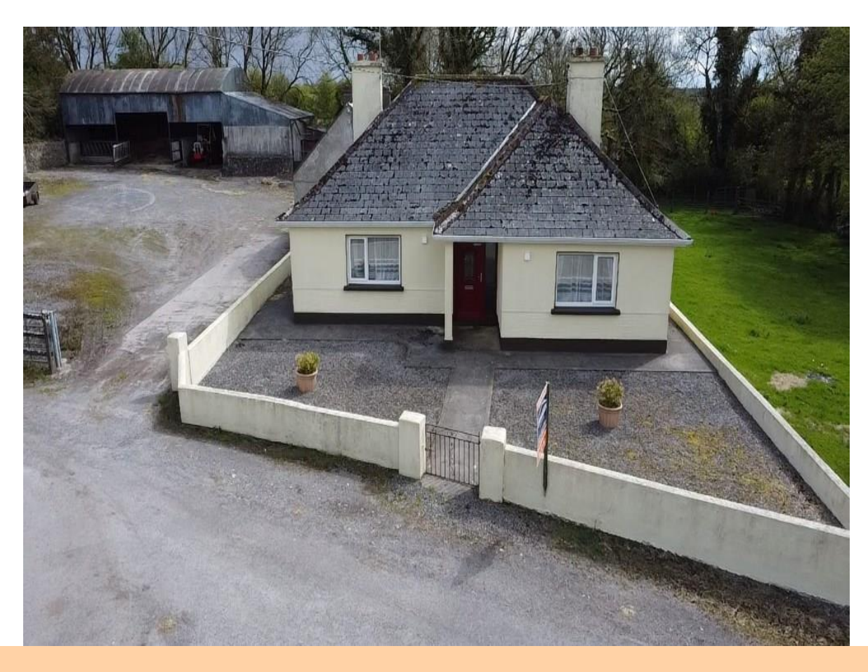
Residence & Outbuildings On C. 0.82 Acres, Lisheennaheltia, Williamstown, F45 ED25