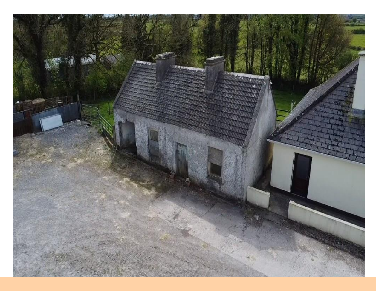
Residence & Outbuildings On C. 0.82 Acres, Lisheennaheltia, Williamstown, F45 ED25