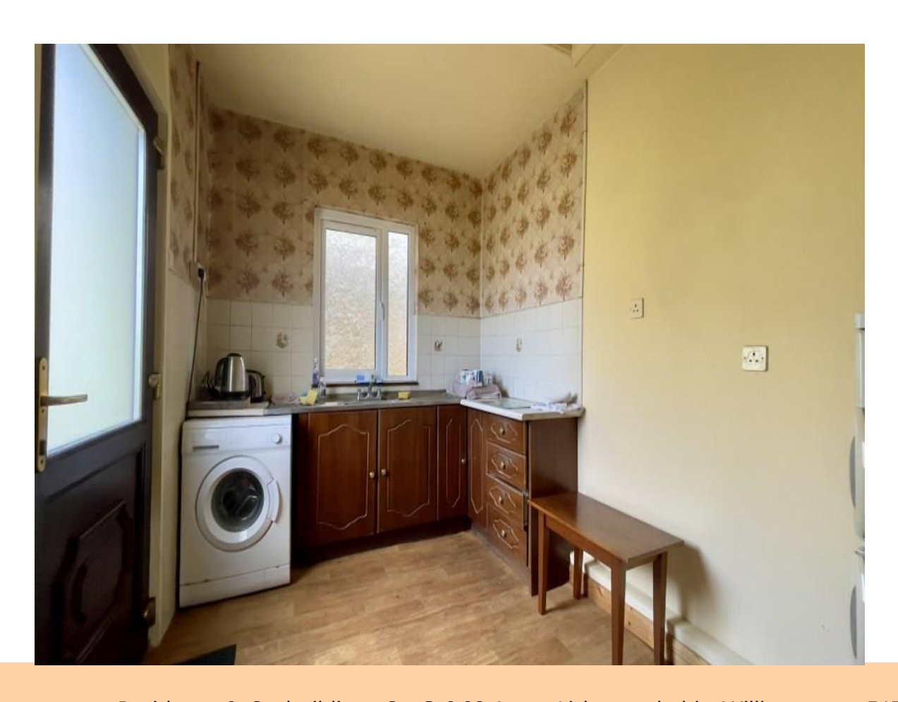
Residence & Outbuildings On C. 0.82 Acres, Lisheennaheltia, Williamstown, F45 ED25