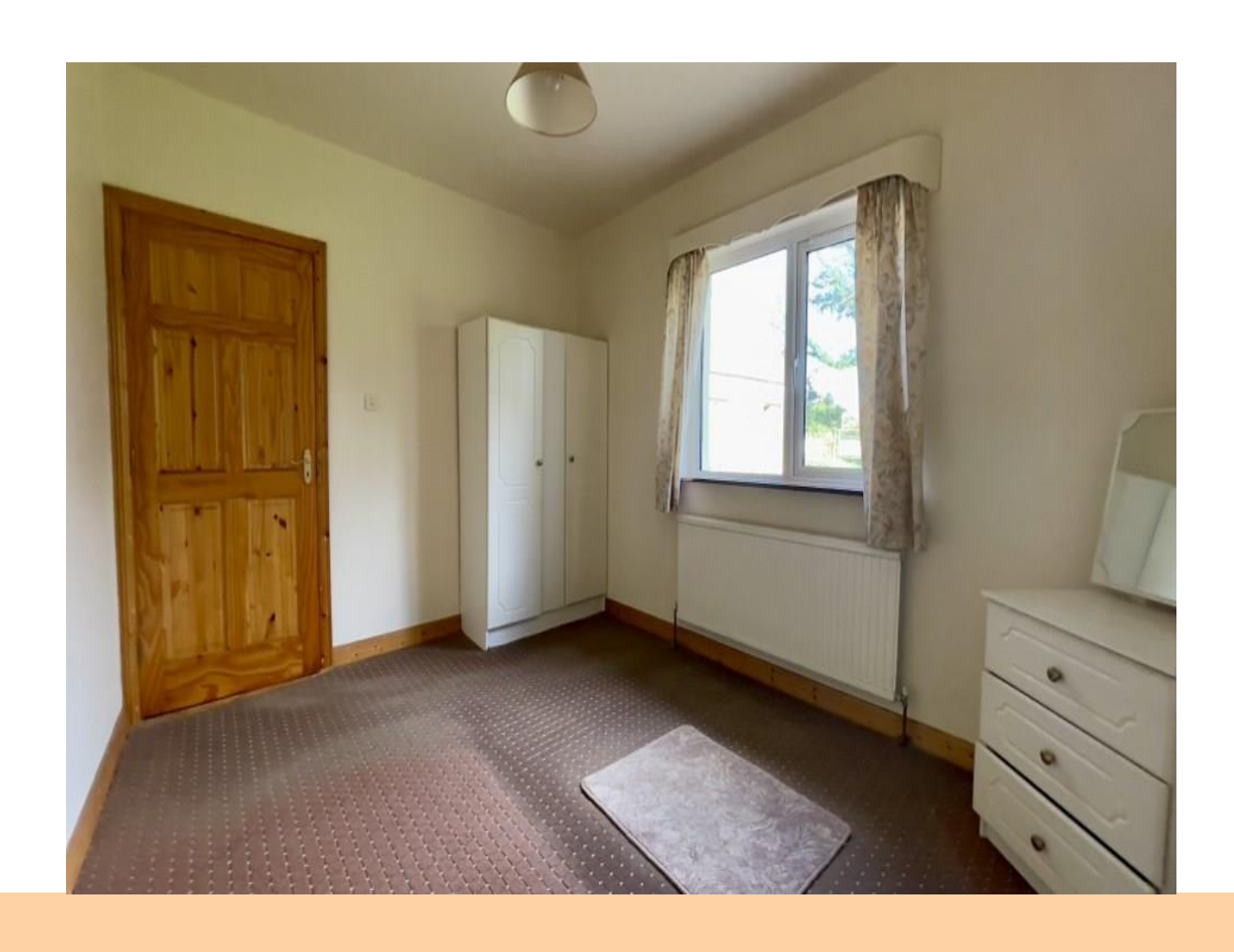
Residence & Outbuildings On C. 0.82 Acres, Lisheennaheltia, Williamstown, F45 ED25