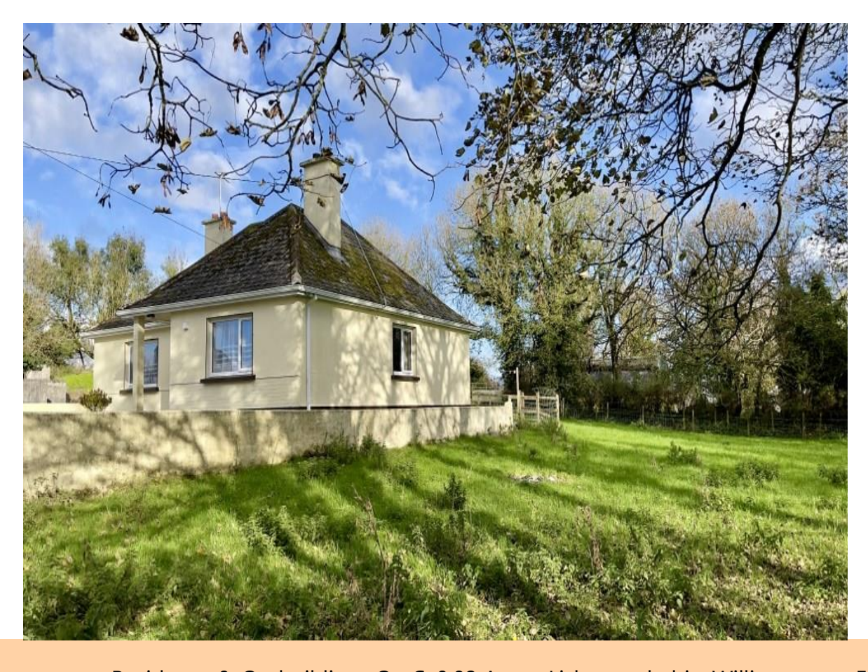
Residence & Outbuildings On C. 0.82 Acres, Lisheennaheltia, Williamstown, F45 ED25