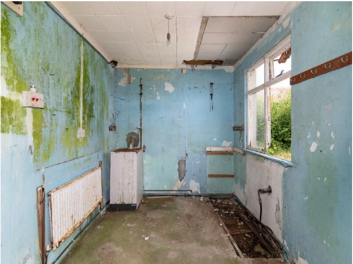
Clooneenbaun (Rockfield), Oran, Co. Roscommon. F42 VW84