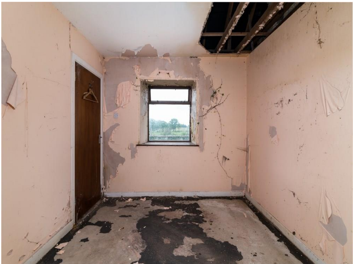
Clooneenbaun (Rockfield), Oran, Co. Roscommon. F42 VW84