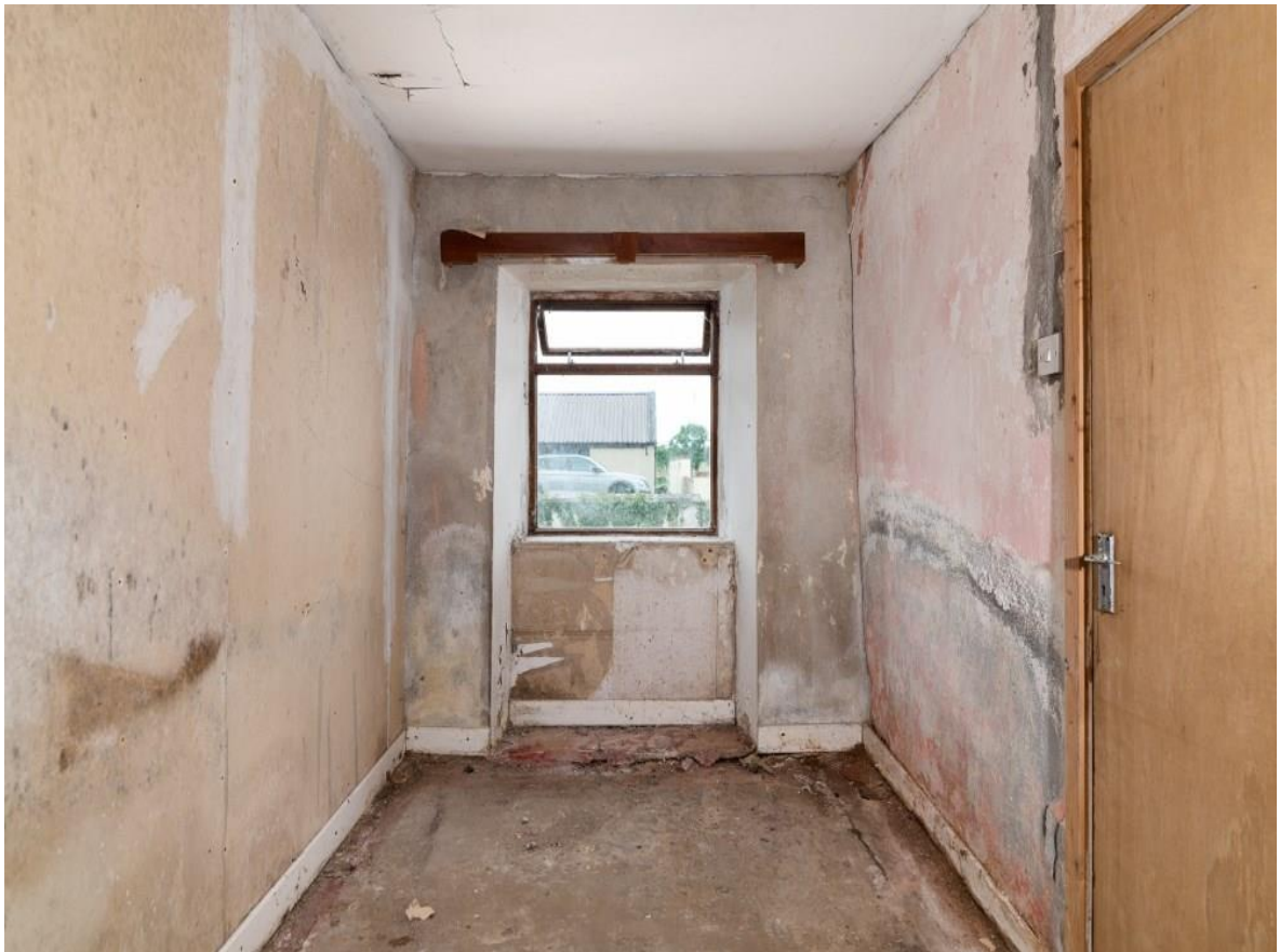
Clooneenbaun (Rockfield), Oran, Co. Roscommon. F42 VW84