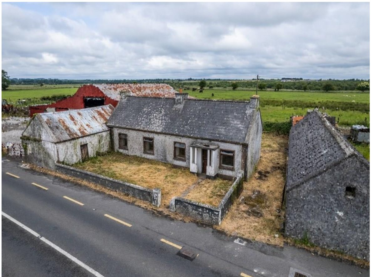
Clooneenbaun (Rockfield), Oran, Co. Roscommon. F42 VW84