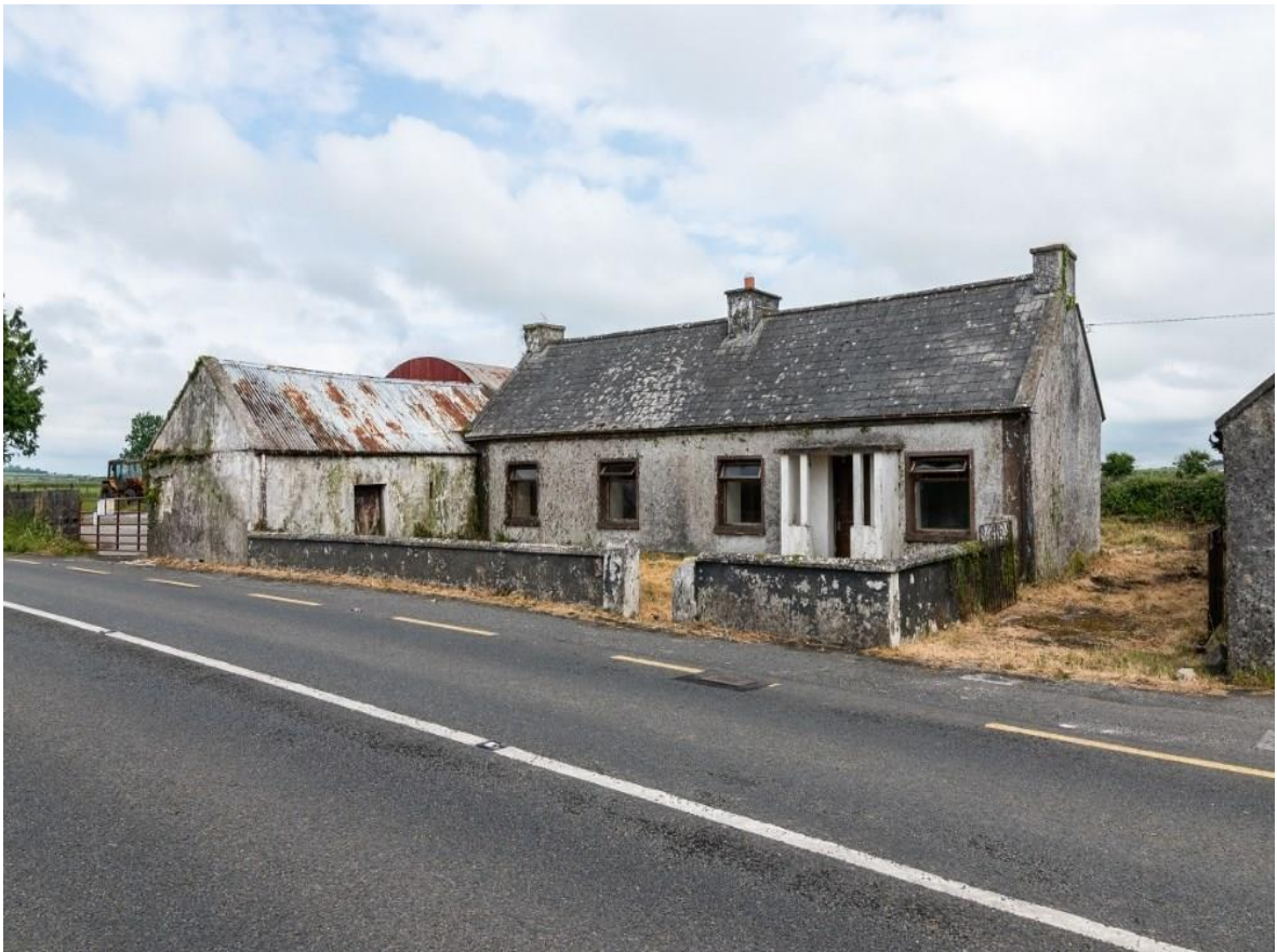
Clooneenbaun (Rockfield), Oran, Co. Roscommon. F42 VW84