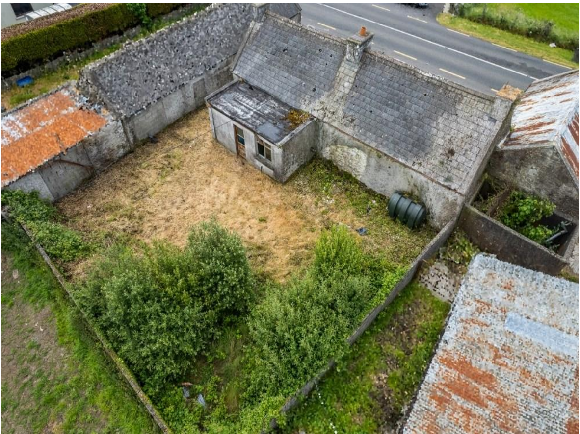
Clooneenbaun (Rockfield), Oran, Co. Roscommon. F42 VW84