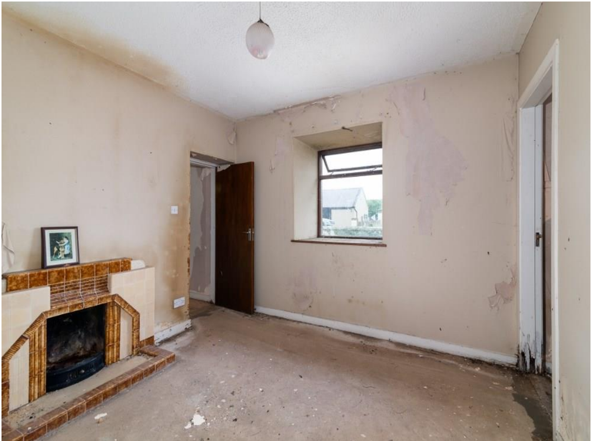
Clooneenbaun (Rockfield), Oran, Co. Roscommon. F42 VW84