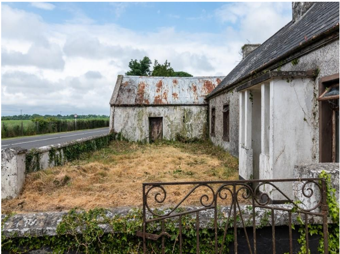
Clooneenbaun (Rockfield), Oran, Co. Roscommon. F42 VW84