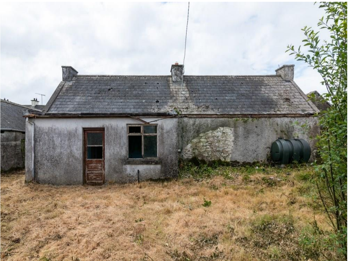
Clooneenbaun (Rockfield), Oran, Co. Roscommon. F42 VW84