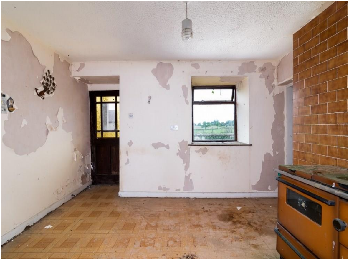
Clooneenbaun (Rockfield), Oran, Co. Roscommon. F42 VW84