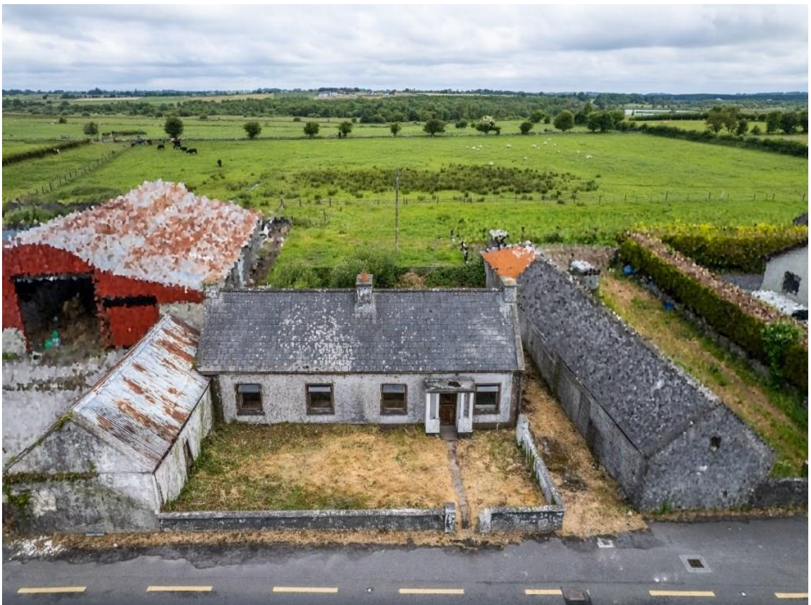
Clooneenbaun (Rockfield), Oran, Co. Roscommon. F42 VW84