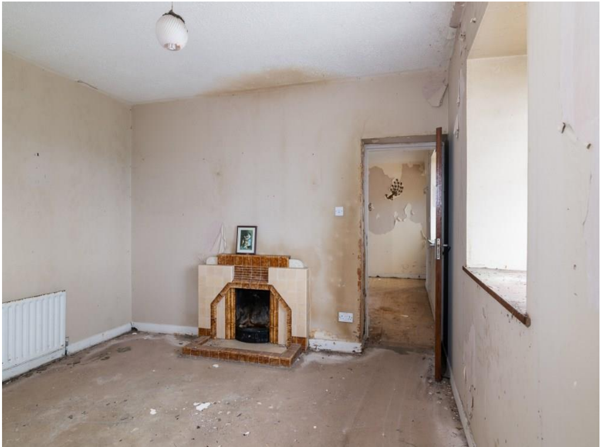
Clooneenbaun (Rockfield), Oran, Co. Roscommon. F42 VW84