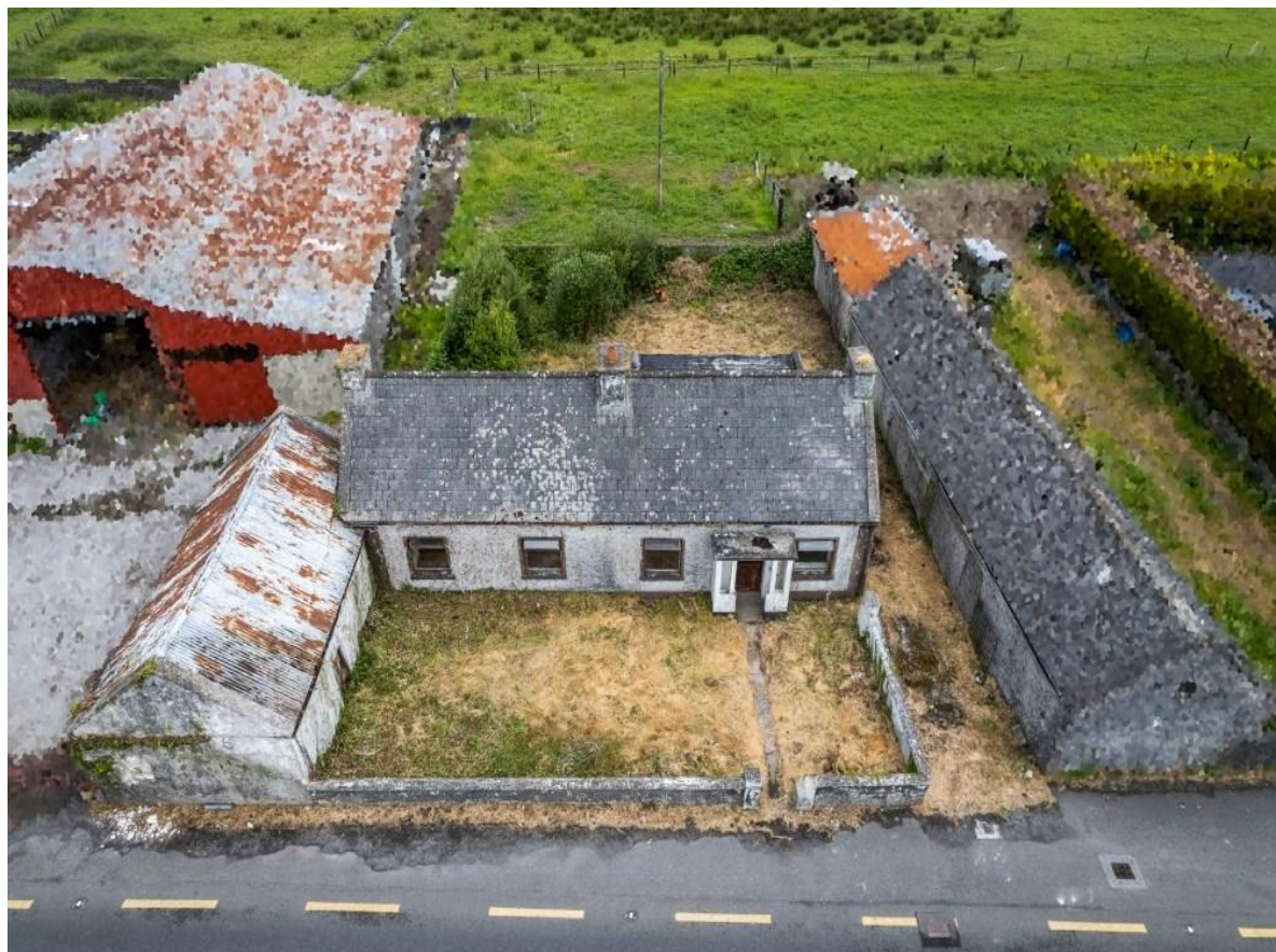
Clooneenbaun (Rockfield), Oran, Co. Roscommon. F42 VW84