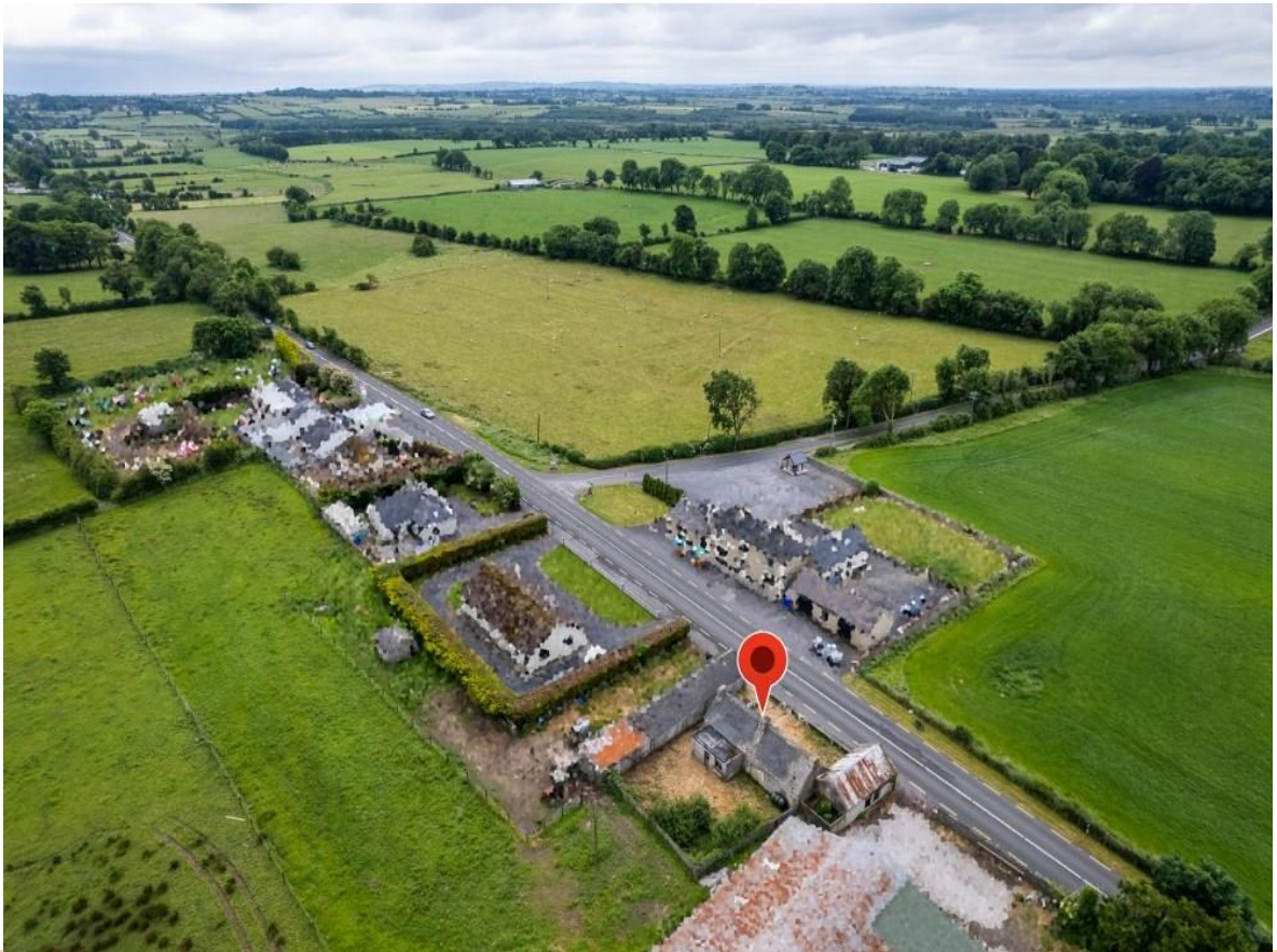
Clooneenbaun (Rockfield), Oran, Co. Roscommon. F42 VW84