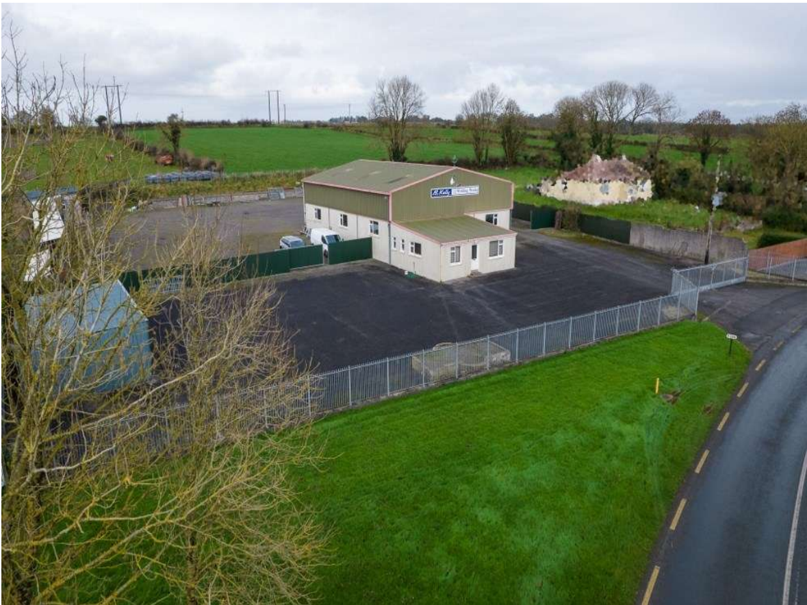
B. Kelly Welding Works, Lissacarrow, Fuerty, Co. Roscommon. F42 CF24