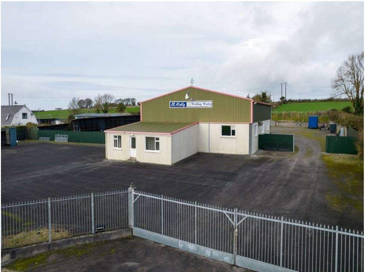
B. Kelly Welding Works, Lissacarrow, Fuerty, Co. Roscommon. F42 CF24