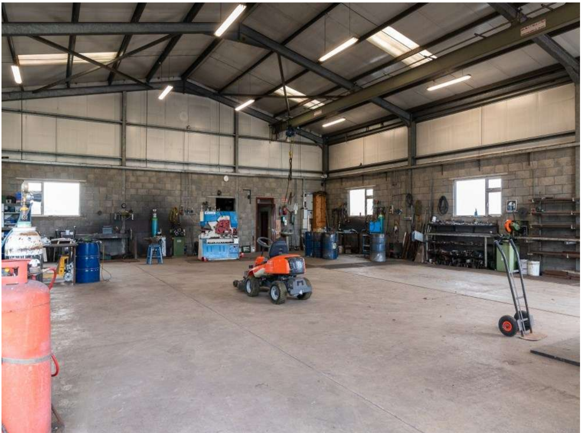
B. Kelly Welding Works, Lissacarrow, Fuerty, Co. Roscommon. F42 CF24