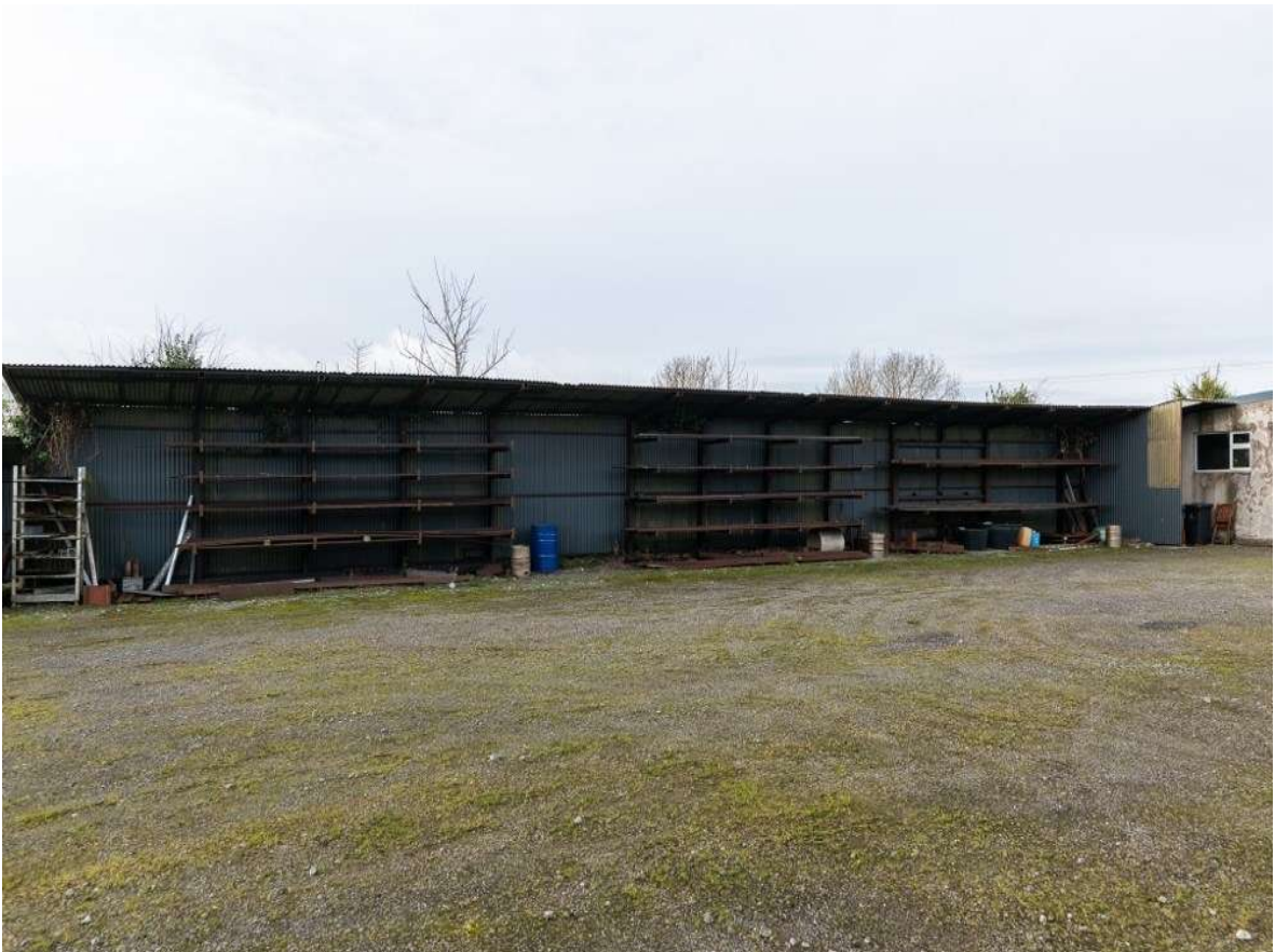
B. Kelly Welding Works, Lissacarrow, Fuerty, Co. Roscommon. F42 CF24