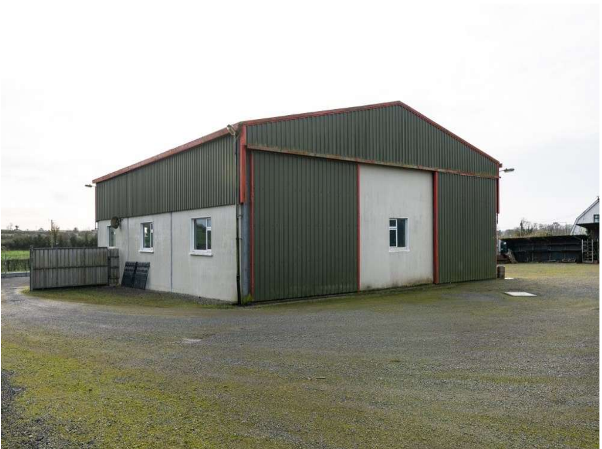
B. Kelly Welding Works, Lissacarrow, Fuerty, Co. Roscommon. F42 CF24