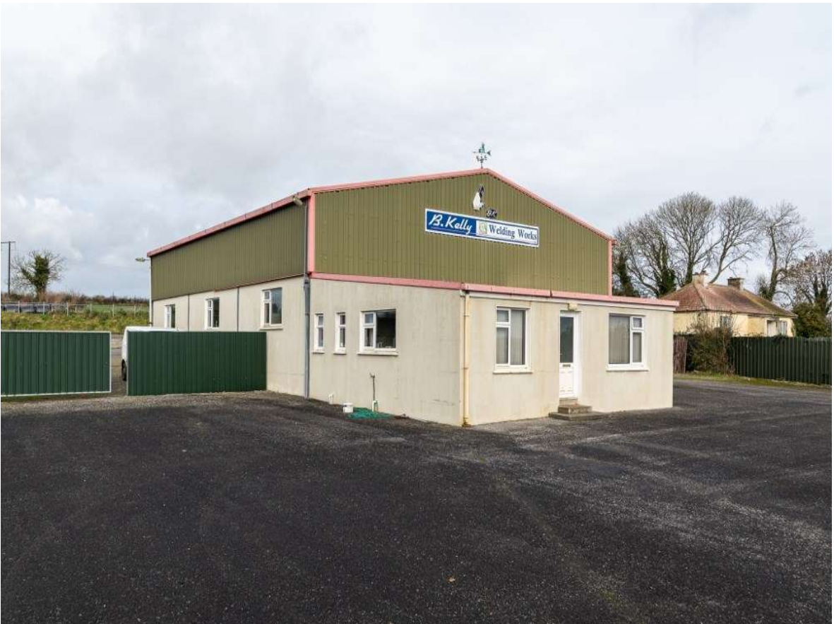
B. Kelly Welding Works, Lissacarrow, Fuerty, Co. Roscommon. F42 CF24