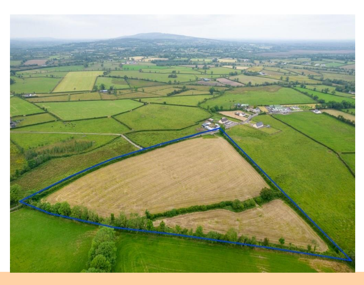
Lisgobbin, Roscommon, County Roscommon