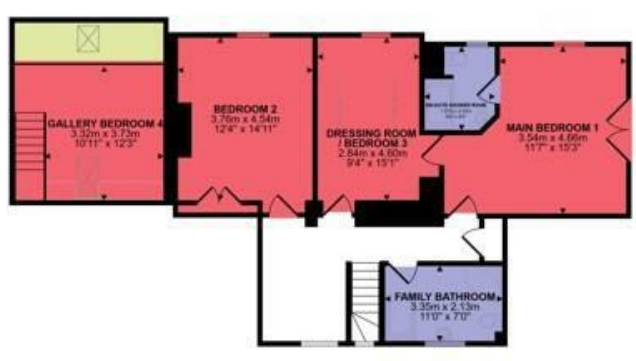
First Floor Approx 107 sq m / 1150 sq ft