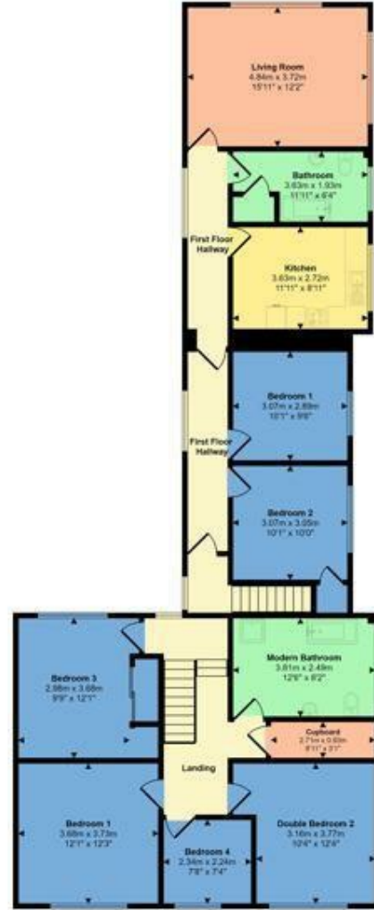
First Floor Approx 146 sq m / 1576 sq ft