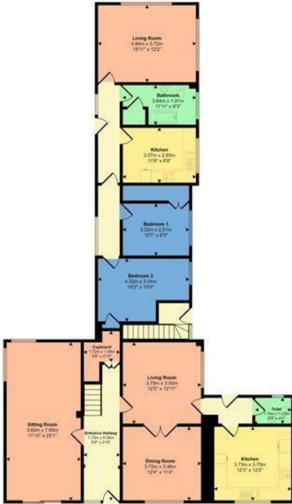
Ground Floor Approx 171 sq m / 1841 sq ft