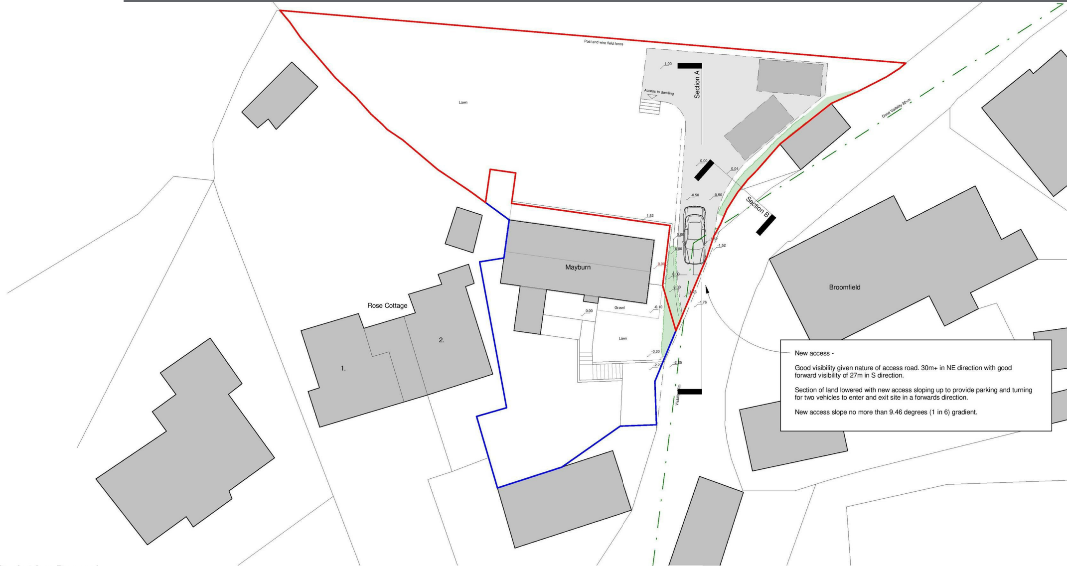
Site sketch as Proposed