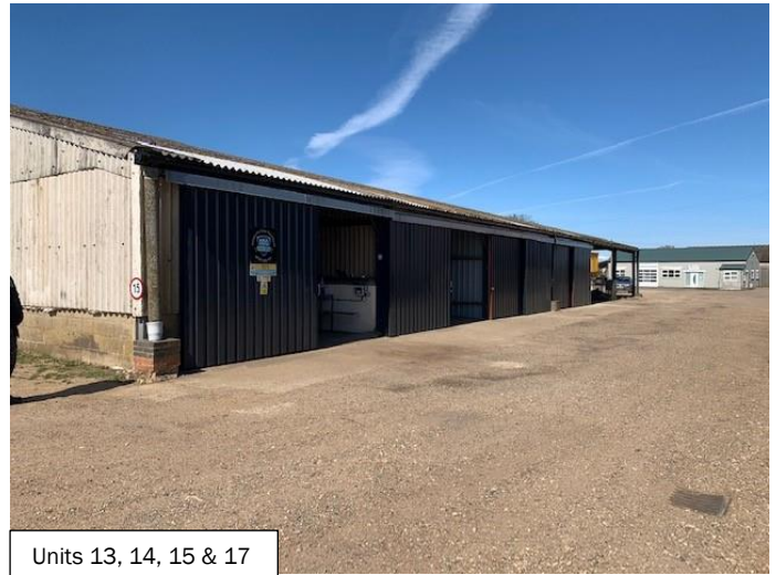
Units 13, 14, 15 & 17