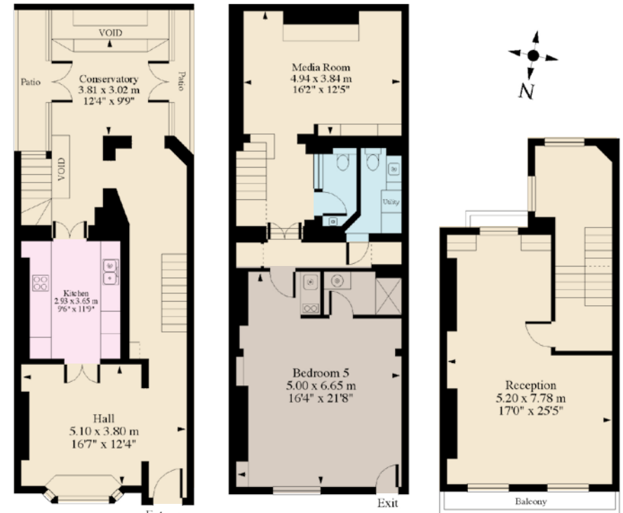
RAISED GROUND FLOOR LOWER GROUND FLOOR