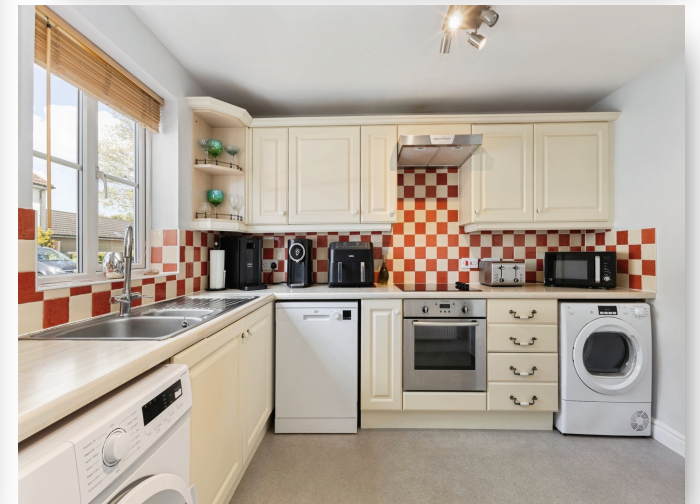
Marauder Road, Norwich NR6 6HD