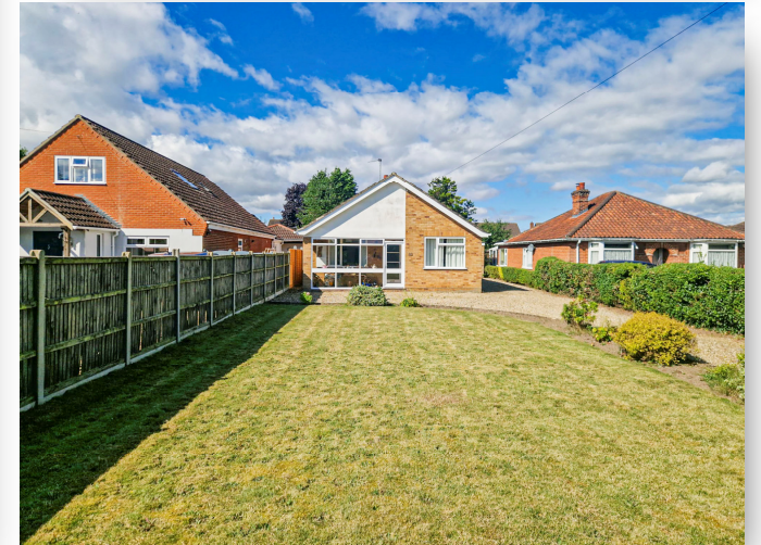
Holt Road, Horsford Norwich NR10 3DN