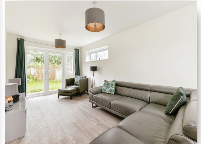
Draper Way, Taverham Norwich NR8 6DG