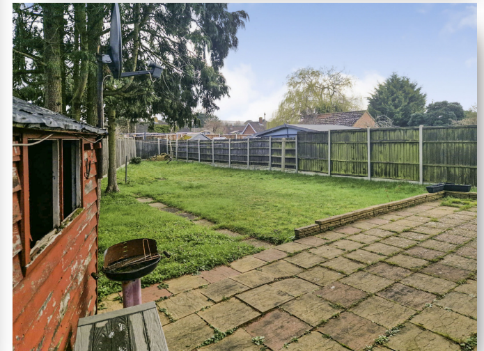
City View Road, Norwich NR6 5HP