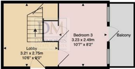
Second Floor IN

Approx. Gross Internal Area: 86.9 m 2 ... 936 ft 2 (excluding balcony)