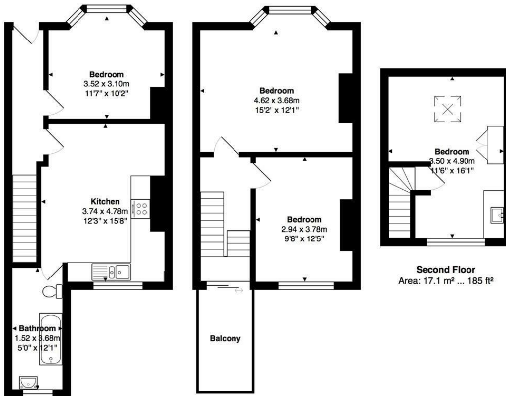
Ground Floor Area: 41.0 m 2 ... 442 ft 2