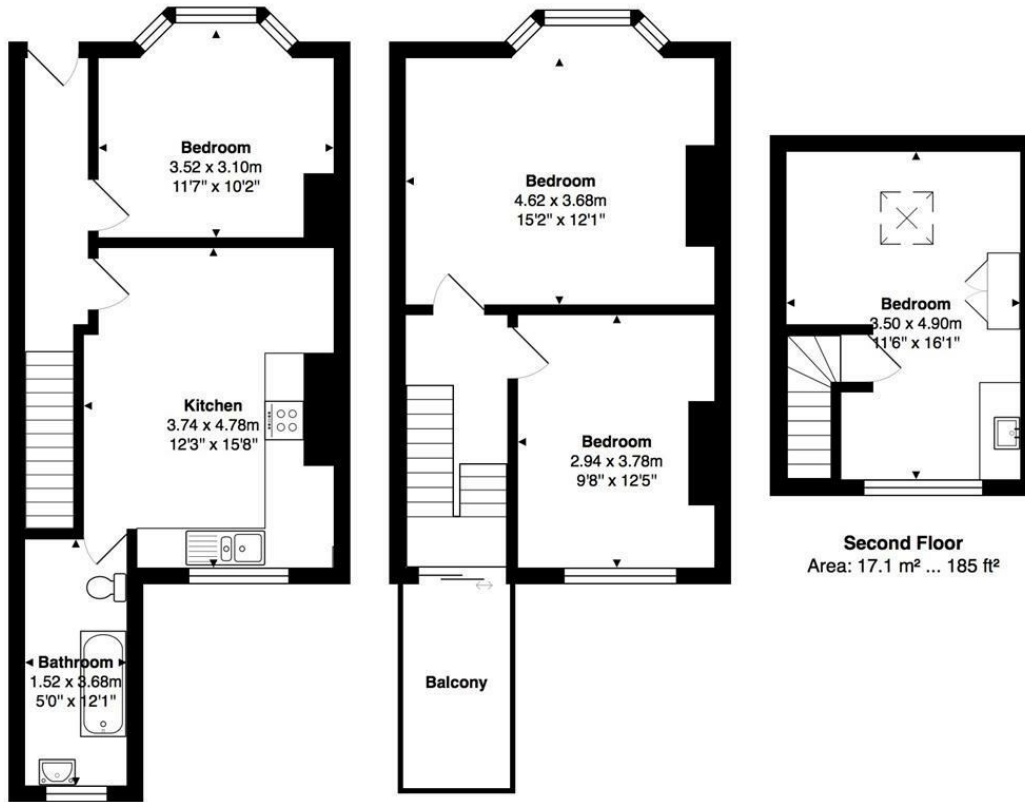
Ground Floor Area: 41.0 m 2 ... 442 ft 2