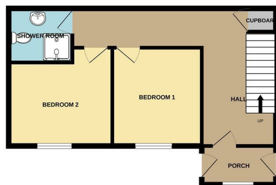
GROUND FLOOR 453 sq.ft. (42.1 sq.m.) approx.