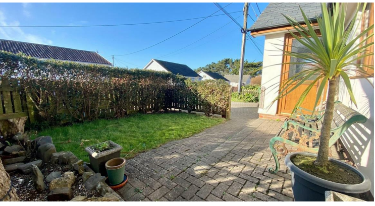
Well Presented & Spacious 3 Bed Detached Bungalow Guide Price

Summer Dyne, 16 Leadengate Close, Croyde, Braunton, EX33 1PT