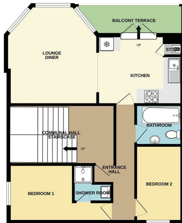
FLAT 3, THE SANDS, WOOLACOMBE

Whilst every attempt has been made to ensure the accuracy of the floorplan contained here, measurements of doors, windows, rooms and any other items are approximate and no responsibility is taken for any error, omission or mis-statement. The plan is for illustrative purposes only and should be used as such by any prospective purchaser. The services, systems and appliances shown have not been tested and no guarantee as to their operability or efficiency can be given. Made with Metrepx C2025