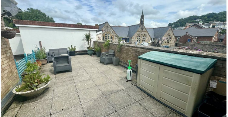
Deceptive 2 Bedroom Apartment 3, Caen Court Caen Street, Braunton, Devon, EX33 1AA