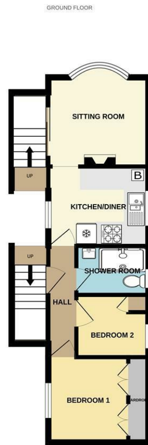
14 DUNE VIEW PARK HOME, BRAUNTON

Whilst every attempt has been made to ensure the accuracy of the floorplan contained here, measurements of doors, windows, rooms and any other items are approximate and no responsibility is taken for any error, omission or mis-statement. The plan is for illustrative purposes only and should be used as such by any prospective purchaser. The services, systems and appliances shown have not been tested and no guarantee as to their operability or efficiency can be given. Made with Metrique 02024