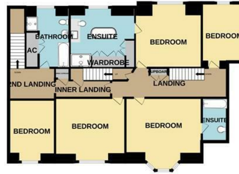
2ND FLOOR 945 sq.ft. (87.9 sq.m.) approx.