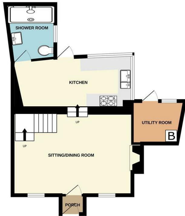
GROUND FLOOR 511 sq.ft. (47.4 sq.m.) approx.