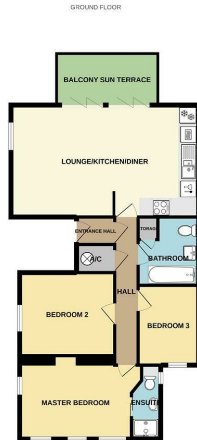
FLAT 4, LORNA DOONE, CROYDE

Whilst every attempt has been made to ensure the accuracy of the floorplan contained here, measurements of doors, windows, rooms and any other items are approximate and no responsibility is taken for any error, omission or mis-statement. The plan is for illustrative purposes only and should be used as such by any prospective purchaser. The services, systems and appliances shown have not been tested and no guarantee as to their operability or efficiency can be given. Made with Metrique 02022