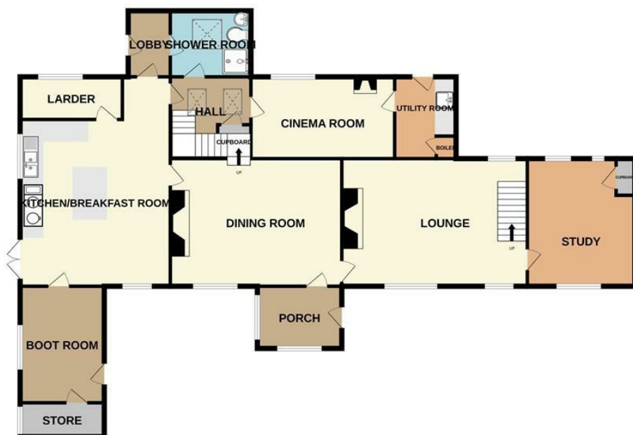
GROUND FLOOR 1734 sq.ft. (161.1 sq.m.) approx.