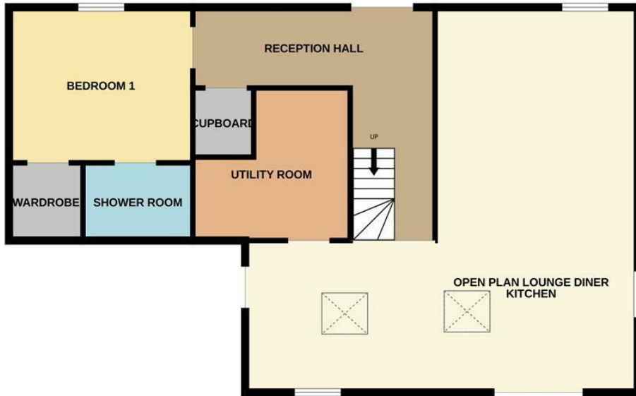
GROUND FLOOR 1061 sq.ft. (98.5 sq.m.) approx.