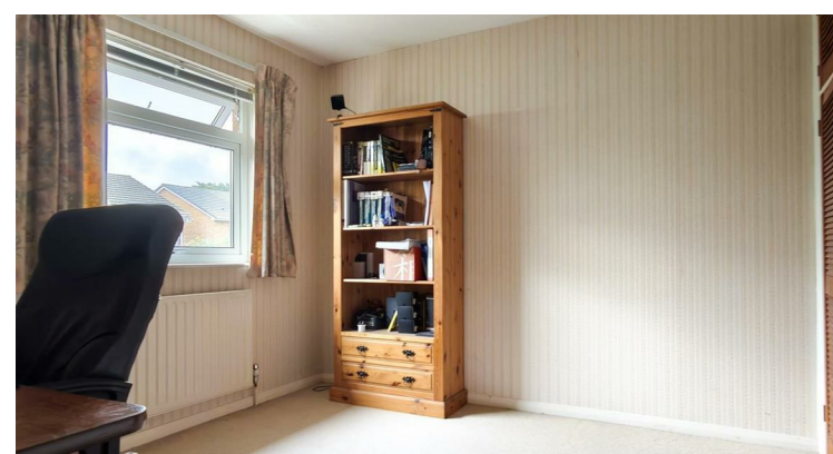
2 Bedroom Semi Detached House