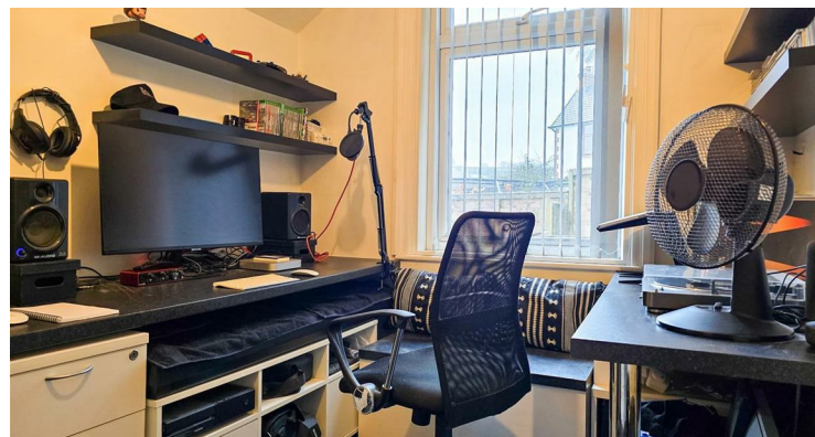
3 Bed House - Terraced

3 Hillsview The Square, Bishops Tawton, Barnstaple, EX32 0DD