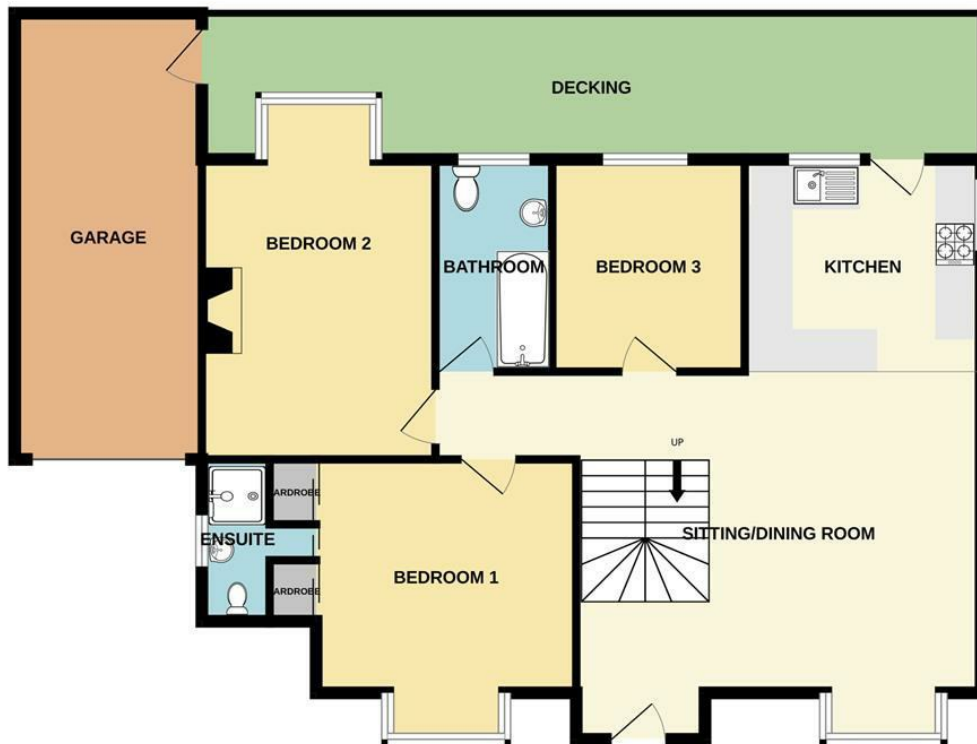
GROUND FLOOR 1099 sq.ft. (102.1 sq.m.) approx.