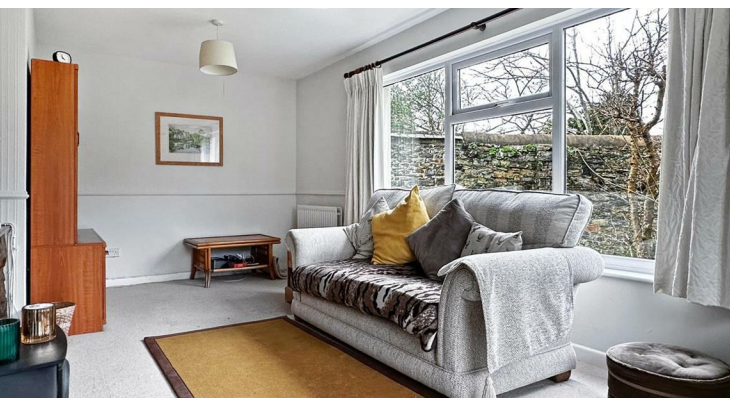
Detached 2 Bed Chalet Bungalow

2 Trafalgar Gardens, Newport, Barnstaple, EX32 9BR