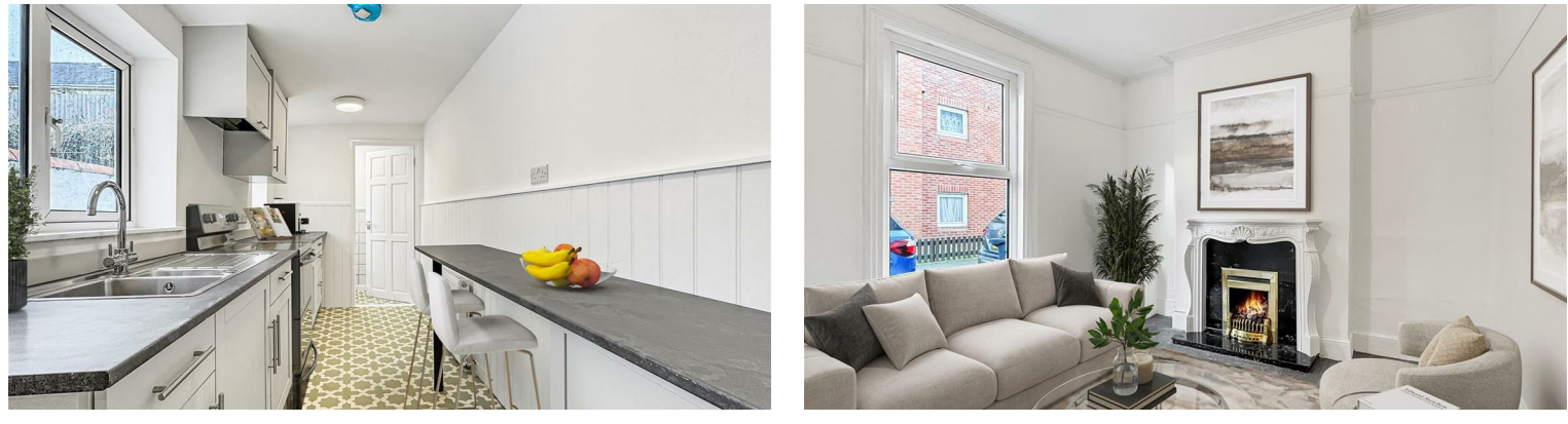
3 Bed House 12 Pulchrass Street, Barnstaple, EX32 8JS