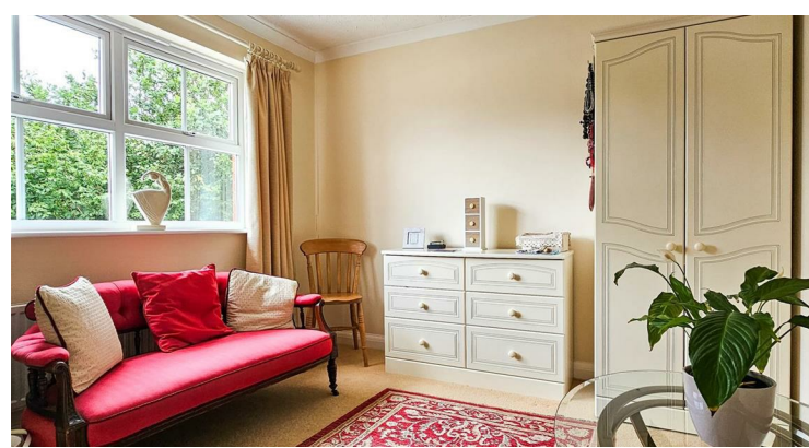
Immaculate 4 Bedroom Detached Home

19 Fallow Fields, Barnstaple, Devon, EX32 9PG