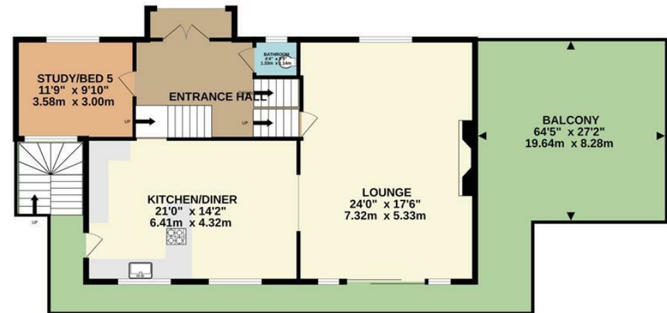
HEBE HOUSE, LOWER LOXHORE, EX31 4SY

Whilst every attempt has been made to ensure the accuracy of the floorplan contained here, measurements of doors, windows, rooms and any other items are approximate and no responsibility is taken for any error, omission or mis-statement. This plan is for illustrative purposes only and should be used as such by any prospective purchaser. The services, systems and appliances shown have not been tested and no guarantee as to their operability or efficiency can be given. Made with Metropix ©2024