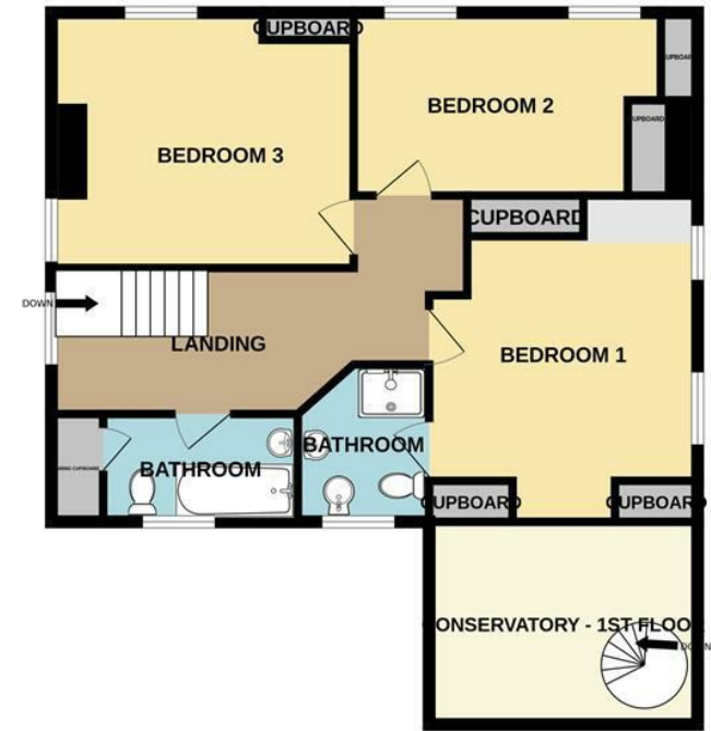
MOORLAND HOUSE, LANDKEY, EX32 0NR

Whilst every attempt has been made to ensure the accuracy of the floorplan contained here, measurements of doors, windows, rooms and any other items are approximate and no responsibility is taken for any error, omission or mis-statement. This plan is for illustrative purposes only and should be used as such by any prospective purchaser. The services, systems and appliances shown have not been tested and no guarantee as to their operability or efficiency can be given. Made with Metropix ©2024