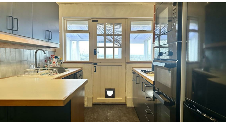
3 Bed Detached Bungalow With Scenic Views

16 Brahms Way, Barnstaple, Devon, EX32 8AH