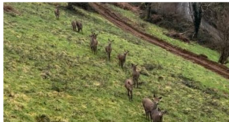
16 Acres, Mature Wood and Pasture

Wood and Paddock, Opposite Broomhill, Muddiford, EX31 4EX