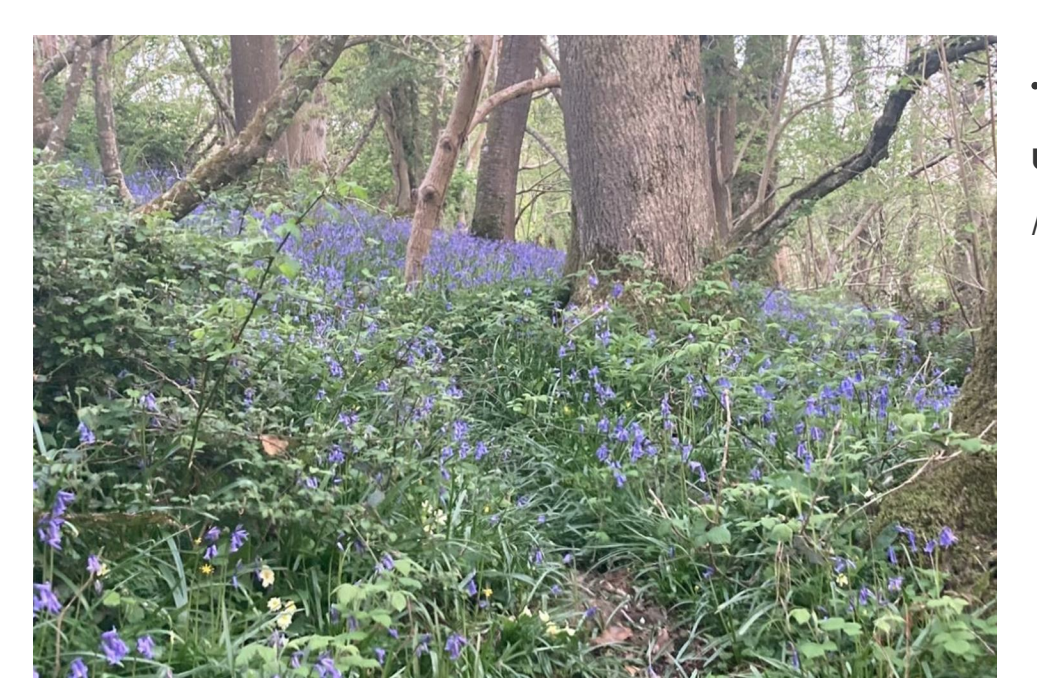
Using what3words free app ///suffer.scars.strain