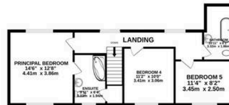
1ST FLOOR 1378 sq.ft. (128.0 sq.m.) approx.