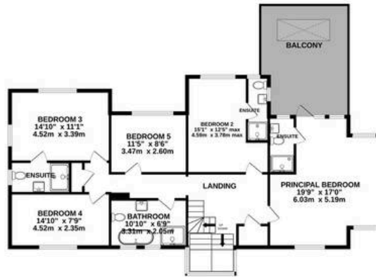
1ST FLOOR 1241 sq ft (115.7 sq m) approx.