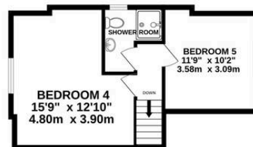
2ND FLOOR 382 sq.ft. (35.5 sq.m.) approx.