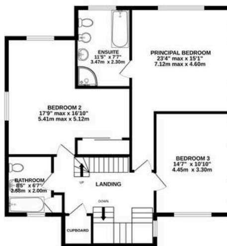
1ST FLOOR 964 sq ft (89.0 sq.m.) approx.