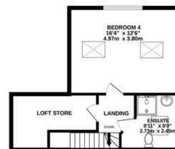
2ND FLOOR 402 sq ft (37.4 sq.m.) approx.