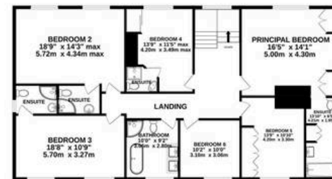
1ST FLOOR 1568 sq.ft. (146.2 sq.m.) approx.