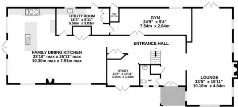
GROUND FLOOR 2125 sq.ft. (197.5 sq.m.) approx.