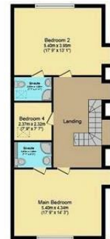
Annexn First Floor Floor area 78.8 sq.m. (848 sq.ft.) approx

Total floor area 403.1 sq.m. (4,339 sq.ft.) approx