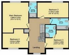
First Floor Floor area 99.6 sq.m. (1,072 sq.ft.) approx