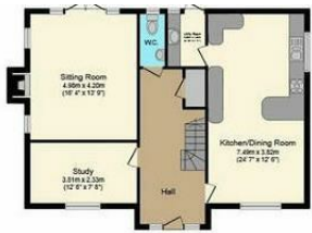
Ground Floor Floor area 84.3 sq.m. (907 sq.ft.) approx