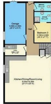
Annex Ground Floor Floor area 107.4 sq.m. (1,156 sq.ft.) approx